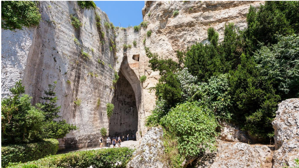
Orecchio di Dionisio (Ear of Dionysius)

In order to book your place on this holiday, please give us a call on 01962 733051 with a credit or debit card, book online at www.naturetrek.co.uk , or alternatively complete and post the booking form at the back of our main Naturetrek brochure, together with a deposit of 20% of the holiday cost plus any room supplements if required. If you do not have a copy of the brochure, please call us on 01962 733051 or request one via our website. Please stipulate any special requirements, for example extension requests, at the time of booking.