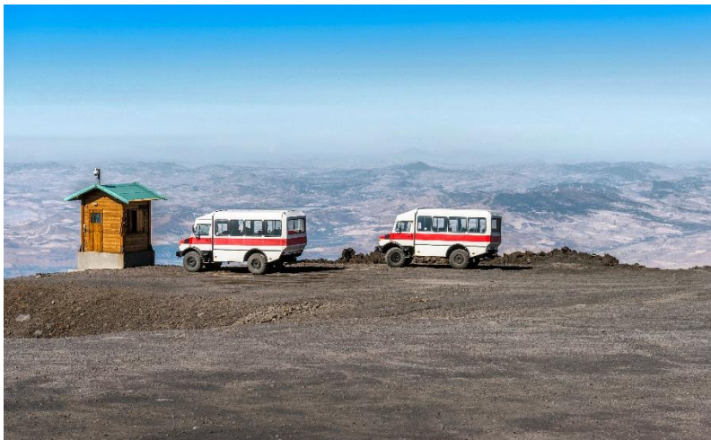
Mount Etna 4x4 Vehicles

highlight of the trip for us all. We will then descend back to the minibus where we will be ready for some lunch!