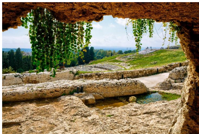
Golden Oriole, Blue Rock Thrush, Nymphaeum at Neapolis Archaeological Park