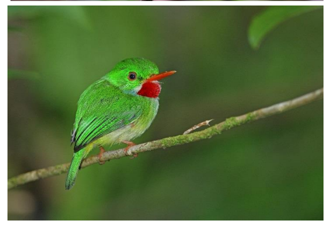
Red-billed Streamertail, Jamaican Lizard Cuckoo, Jamaican Tody