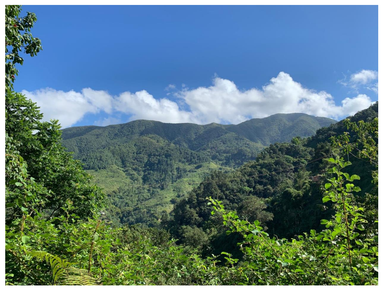
John Crow Mountains

During the week we will venture out to the Blue and John Crow mountains where some key endemics not to be found elsewhere will be our target. A number of other locations will also be visited, but for those that would prefer to skip an activity or take an afternoon off you can do just that. Reading by the swimming pool or relaxing in a hammock are some of the options.