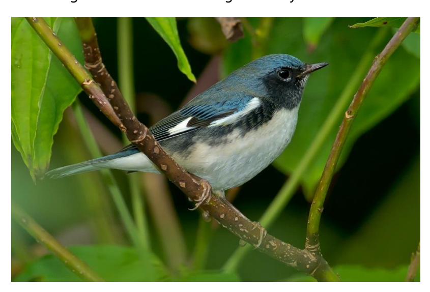
Black-throated Blue Warbler

After a long day out in the field yesterday, today will see us undertake little travelling as we head to Strawberry Fields (forever). The walking starts on a rubby track where you pass stools owned by local villagers and childern making their way to school. Yellow-faced and Black-faced Grassquits