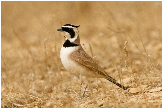
Temminck's Horned Lark

Today we head west to the irrigated oasis of Al-Abraq which is a magnet for migrants surrounded by arid desert. This site has a reputation for attracting rare migrants and there have been many firsts for Kuwait recorded here. Numbers of migrants can be high, and at this time of the year a diverse selection of Palearctic migrants may be found. We will also search the surrounding desert for arid specialists such as Temminck's and Desert Larks.