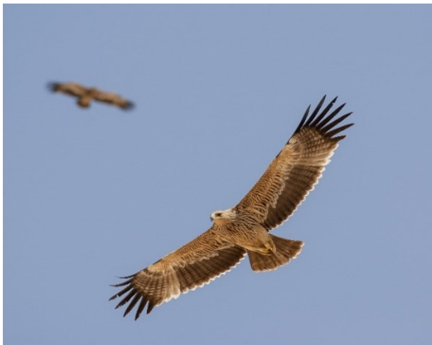
Eastern Imperial Eagle

Our morning begins at Jahra Pools Reserve, Kuwait's premier wetland and birding site. 220 species have been recorded here including many rarities. The site is man-made and consists of small pools