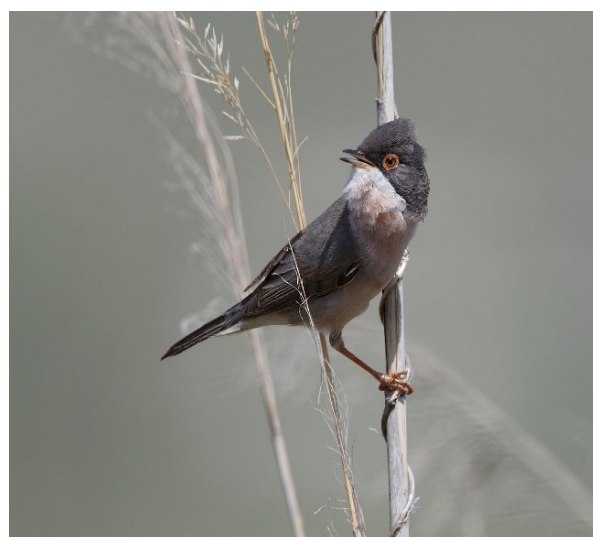
Crab-plover, Blue-cheeked Bee-eater, Menetries's Warbler