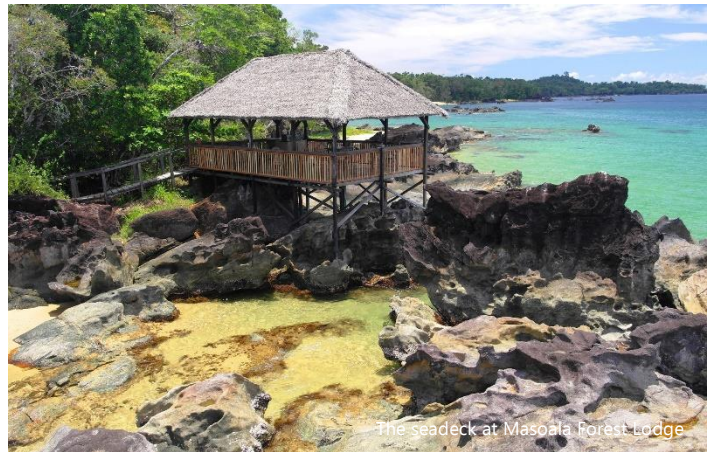
The seadeck at Masoala Forest Lodge