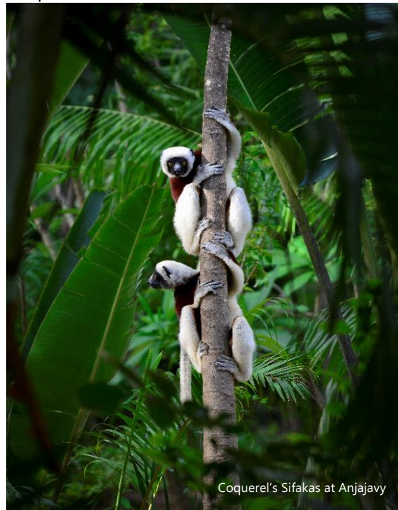
Coquerel's Sifakas at Anjajavy

The tour begins with a visit to the unique spiny forest habitat on the south-west coast, where the vegetation evolved to protect itself from not long extinct giant lemurs that used to live here. This fascinating habitat is home to many species that are only found here, and our hotel on the beach overlooking the Mozambique Channel is the perfect base to relax.