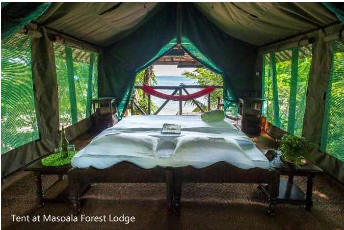
Tent at Masoala Forest Lodge

After we have settled into our tents, we should have time for an initial exploration of the beach and coastal forest in the vicinity of the lodge, where we might be fortunate to see the elegant Madagascar Pratincole.