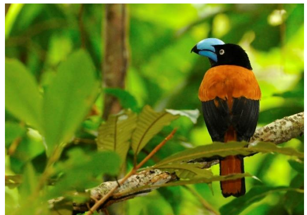
From top: Red-ruffed Lemur, Moramamba Bay, Helmet Vanga