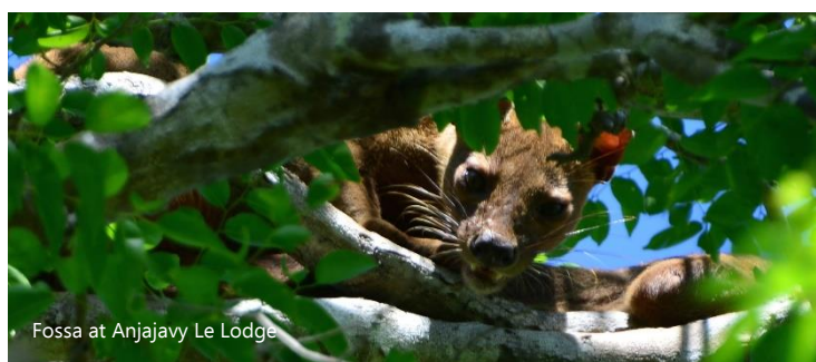
Fossa at Anjajavy Le Lodge