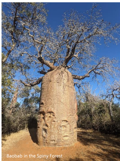
Baobab in the Spiny Forest

Our flight usually departs from Ivato International Airport in the early afternoon, arriving back into London the following morning.