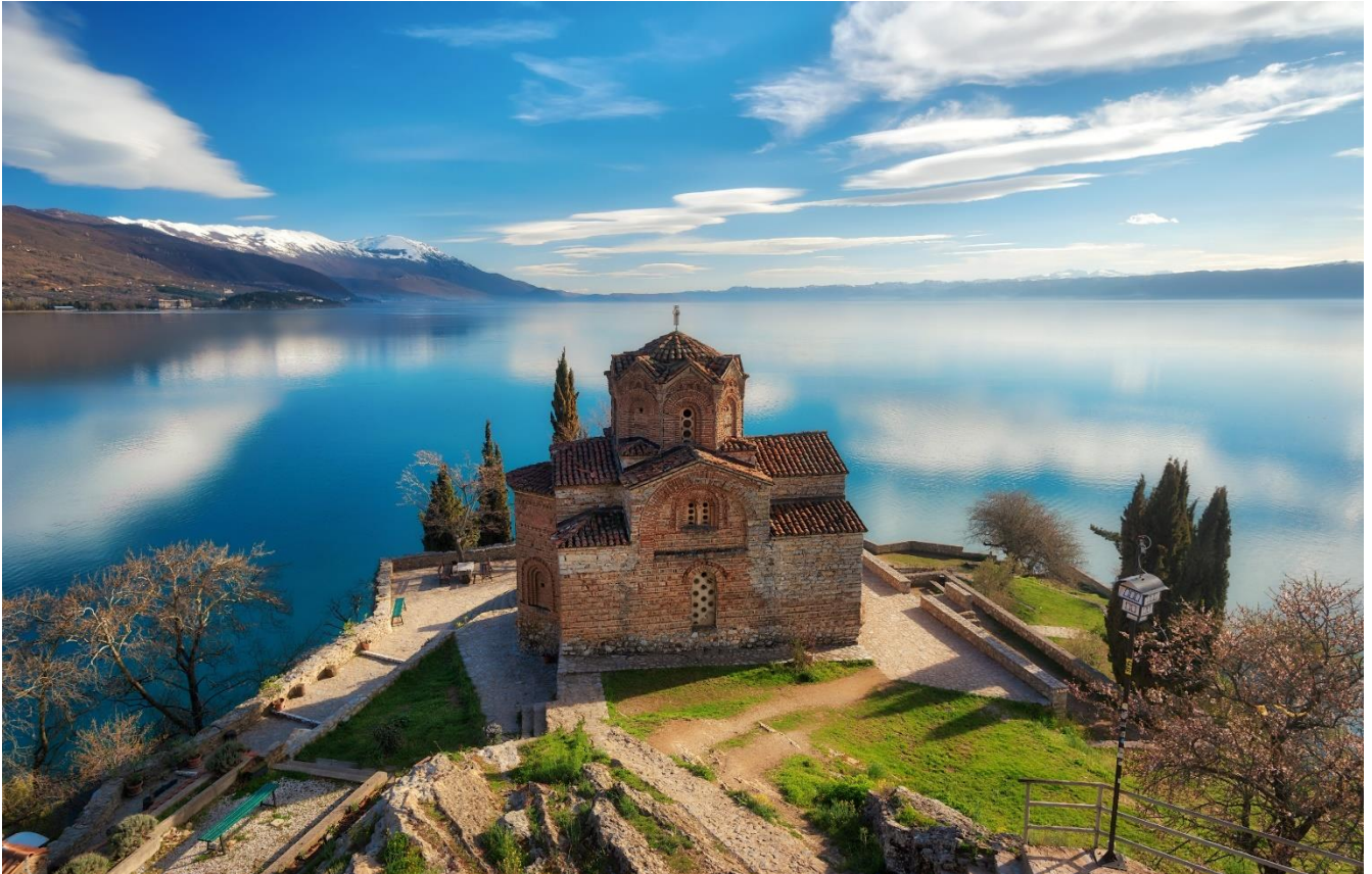
Church of St John, Ohrid

In order to book a place on this holiday, you will need to read the Naturetrek terms and conditions in the back of our brochure or on our website, and then book either online at www.naturetrek.co.uk , by calling us on 01962 733051, or by completing and returning the booking form in the brochure together with a deposit of 20% of the holiday cost. If you do not have a copy of this brochure, please call us on 01962 733051.