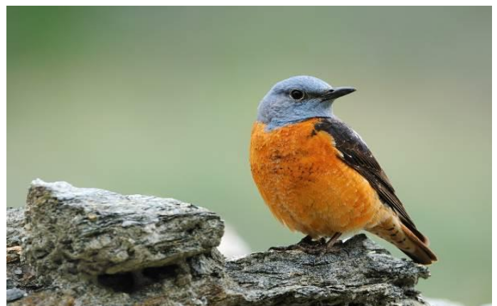
Little Tiger Blue, Pelister National Park & Common Rock Thrush