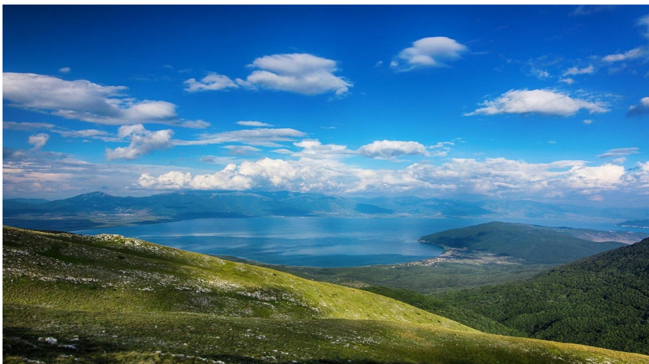
Galicica National Park

It will be a most varied and fascinating two days exploring this area with endless fantastic views, a range of different habitats and elevations and hence such a wide range of species.