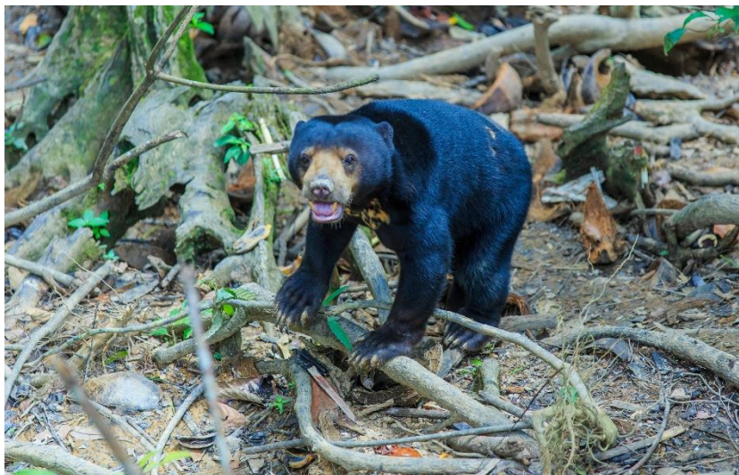
Malay Sun Bear

Deramakot Reserve embraces mature secondary and primary lowland rainforest, and is home to many of Borneo's larger iconic mammal species including Sunda Clouded Leopard, Malay Sun Bear, Orangutan, Bornean Gibbon, Pygmy Elephant, and the Tembadau (Banteng). The 55,000 hectare reserve (along with its similar sized neighbor) is an important area for conservation as it is one of the last remaining areas of Sabah's original lowland forest. Here, the network of access roads makes observing wildlife easier and without the rules and regulations so frequently found elsewhere in Asia, we are free to explore at our own pace.