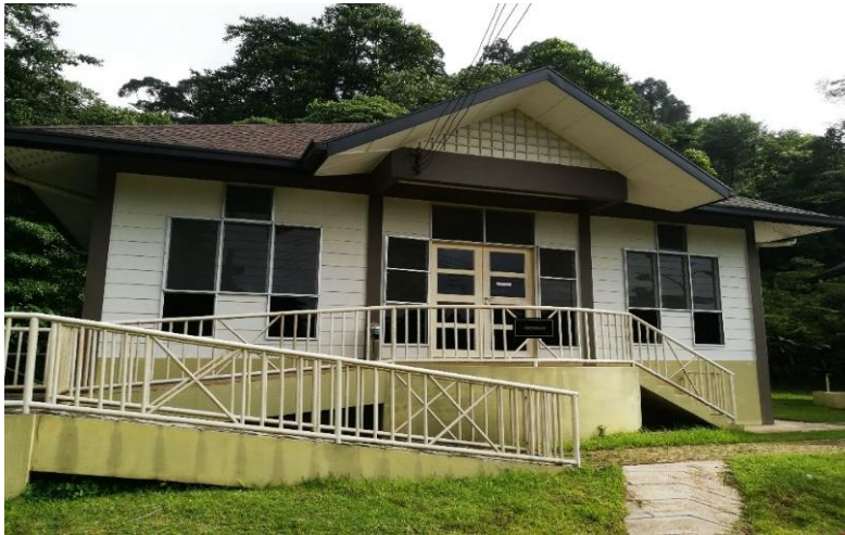
Chalet at Deramakot Forest Reserve

As of September 2017, the Bornean government has implemented a tourist tax to be paid upon