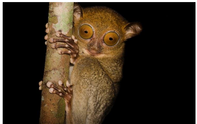
Sunda Clouded Leopard, Bornean Pygmy Elephant, Western Tarsier