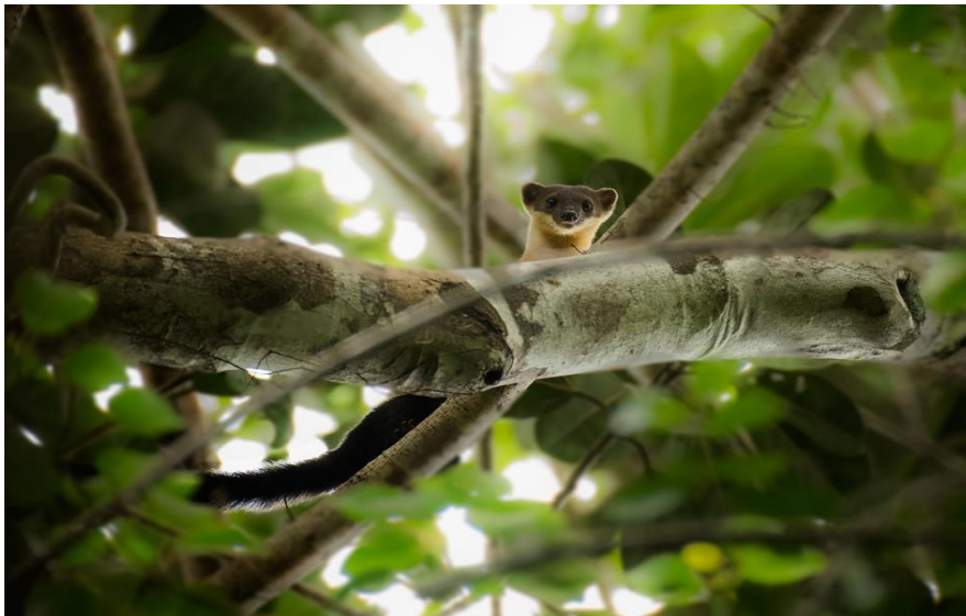
Yellow-throated Marten (Mike Gordon)

The principle focus of our holiday will be trying to see some of Borneo's most elusive mammal species, particularly during our time at Deramakot Forest Reserve. As we visit some of the most magnificent rainforests on Earth, we will be entering the domain of many wonderful birds, reptiles