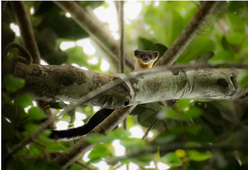
Yellow-throated Marten (Mike Gordon)

The principle focus of our holiday will be trying to see some of Borneo's most elusive mammal species, particularly during our time at Deramakot Forest Reserve. As we visit some of the most magnificent rainforests on Earth, we will be entering the domain of many wonderful birds, reptiles and insects. These will be enjoyed too of course. With the aid of local expertise, every effort will be made to locate mammals in