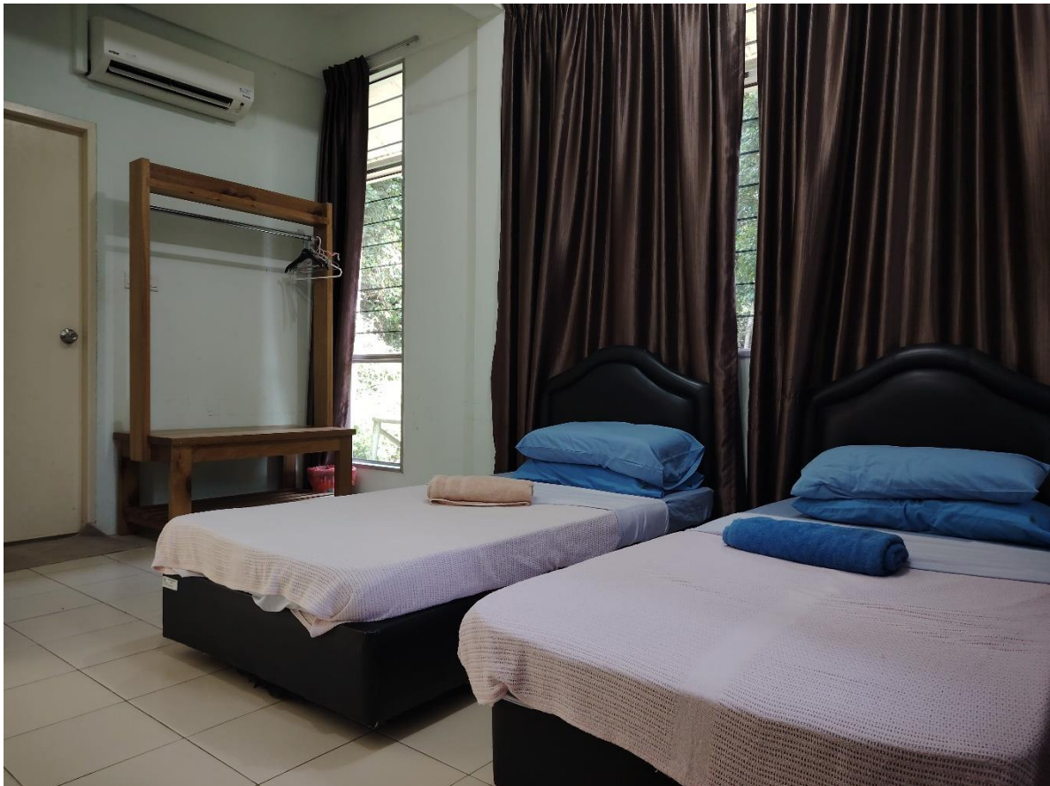
Above: The accommodation is of a basic level at Deramakot, but rooms are clean and comfortable, air-conditioned and en-suite. This is a remote location in fantastic lowland rainforest and is the only lodging here that allows us to access this vast reserve in search of its special wildlife.