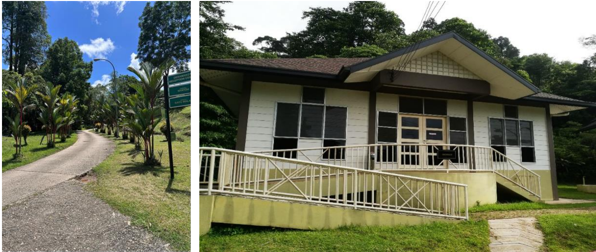
Chalet at Deramakot Forest Reserve.

Toiletries and towels are provided at all lodges on the tour. There is currently no WI-FI in Deramakot.