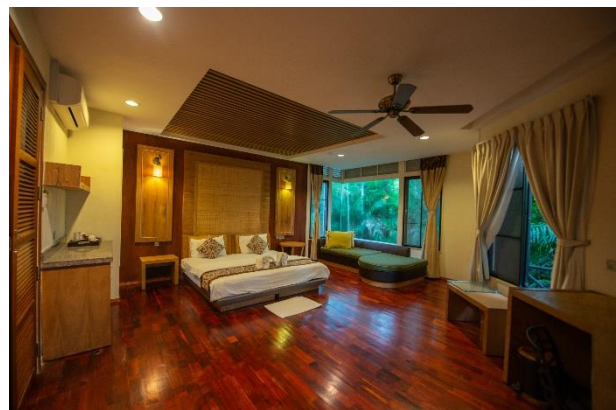
A Typical Room at Kinabatangan Wetland Resort

During our time in Deramakot Forest Reserve we will be staying in simple air-conditioned tourist chalets with private bathrooms. Each chalet typically has two bedrooms with a shared communal area. The chalets pictured below are of a basic nature compared to Sepilok and our lodge on Kinabatangan River. This is a remote reserve that used to be used for students and one of the very few which allows such extensive night time drives, so we are really dealing with what we have here and those booking the holiday should be prepared for some basic accommodation at Deramakot in return for the chance to see a range of rare and difficult to see mammals and of course a range of birds too. The rooms though are clean and comfortable and adequate for our needs. The dining area is around 200 meters away down a fairly steep paved path.