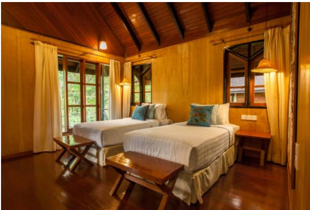
A Typical Room at Sepilok Nature Lodge

Accommodation during our time in Sepilok and on the Kinabatangan River will be in comfortable and well-situated eco-lodges, typically offering twin-bedded rooms with private facilities.