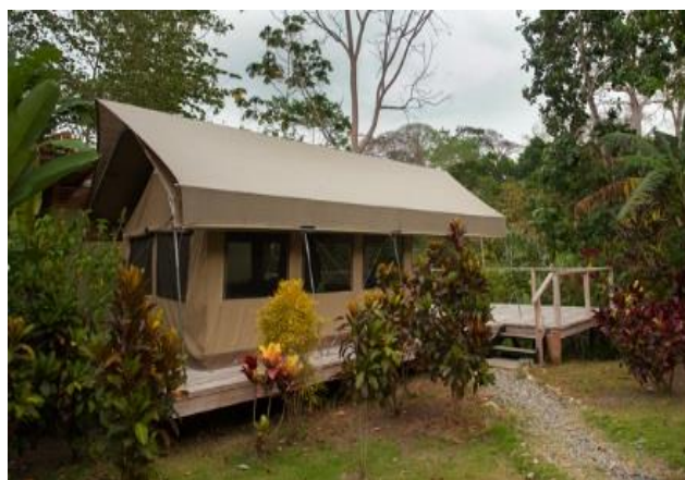
Harpy Eagle, Golden Headed Manakin and Camp Tent