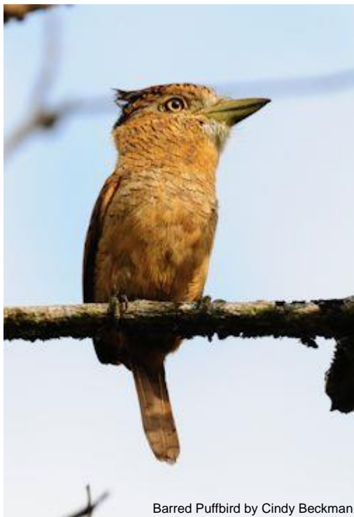
Barred Puffbird by Cindy Beckman

from the surrounding forests; while Pale-bellied Hermit and Sapphire-throated Hummingbird visit the flowers around camp.