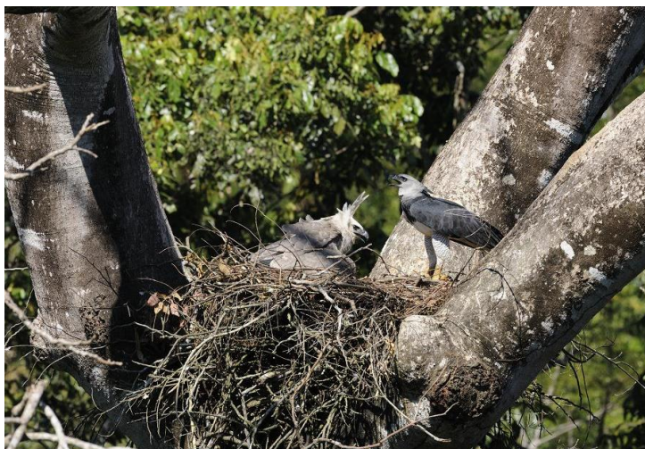
Harpy Eagle at its nest

incubated for about 56 days. After another 36 days, the chick starts awkwardly standing and walking. At about 6 months of age the chick will fledge, but is still fed by its parents for a further 6-10 months and becomes more visible as it perches in or close to the nesting tree. This means the chances of seeing this impressive bird are very high during 2017! The national bird of Panama, and among the largest eagles in the world, similar in weight to the Philippine Eagle and Steller's Sea Eagle, but the Harpy has a more compact wingspan, perfect for navigating the sprawling tropical forests to which it is confined. Apex predators at the top of the food chain, Harpy Eagles prey primarily on tree-dwelling mammals, which research has shown to be about 79% sloths and 11.6% monkeys. Monkeys that are commonly preyed upon include Saki, Capuchin, Howler, Squirrel, Titi, and Spider Monkeys. Smaller monkeys, such as Marmosets and Tamarins, seem to be ignored by the great Harpy Eagle.