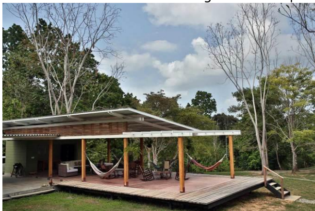
Canopy Camp Social Area

After some relaxation time during the hottest part of the day, we will visit the property of the Tierra Nueva Foundation. Fundación Tierra Nueva is a non-profit organization whose main mission is “working towards the sustainable development of people of the Darién Rainforest”. The property is the home of a technical school focusing on applications in agriculture. We will explore the trails of this large property, in the hope of finding Streak-headed Woodcreeper, Yellow-breasted and Black-billed Flycatchers, Red-rumped Woodpecker, Slaty-backed