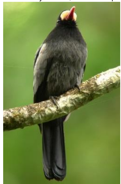
White-fronted Nunbird

We will wake before dawn to pack and have an early breakfast, say our goodbyes to the Canopy Camp, and start our journey back to Panama City. We will stop at San Francisco Nature Reserve, a private forest reserve owned and managed by the St. Francis Foundation, covering 1,300 acres in eastern Panama