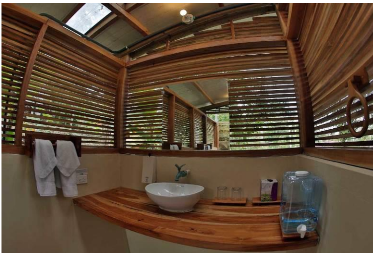
Canopy Camp Bathroom

The Darién, as this entire easternmost region of Panama is called, is one of the most diverse and species-rich regions of Central America. Here, some of the last large, relatively untouched swathes of lowland rainforest await exploration! Long revered by avid birders as a haven for rare species, including the majestic Harpy Eagle, Panama's national bird, this region is now readily accessible by a new highway, extending through the spine of Panama right into the heart of this bird-rich land. During this exciting, 6-night adventure, we visit various exciting birding sites as described below with a special day dedicated to seeing the mighty Harpy Eagle at an active nest site!