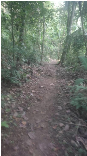
Path to Harpy Eagle nest site.

Again although the Harpy Eagle is our ultimate target on this tour, a host of other species are possible in this famously endemic-rich region. We will be based at the very comfortable Canopy Camp lodge which offers large very comfortable, safari-style tented accommodation with private bathroom facilities. Gray-cheeked Nunlet, White-headed Wren and Pale-bellied Hermit are among the specialities around the camp grounds, along with an excellent variety of tanagers, woodpeckers, puffbirds, kingfishers, flycatchers and raptors.