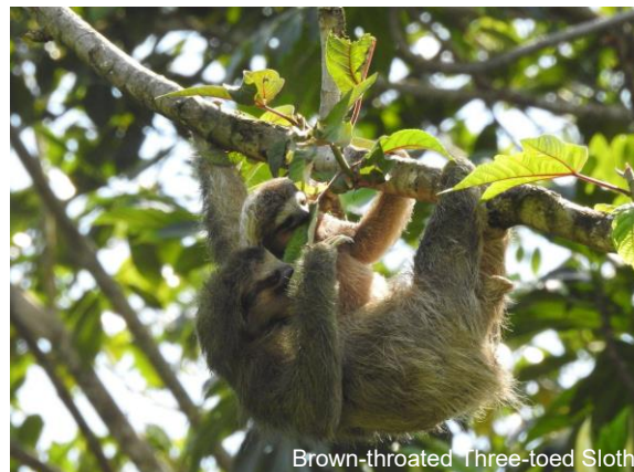
Brown-throated Three-toed Sloth

Other lowland specialties might include Brown Jay, White-crowned Parrot, Morelet's Seedeater, Olive-crowned Yellowthroat, White-winged Becard, Trilling Gnatwren, Wedge-billed Woodcreeper, Black-and-yellow Tanager, Buff-rumped Warbler, Torrent Tyrannulet, and both Finsch's and Sulphur-winged Parakeets. In the late afternoon we will work our way back through the lowland foothills, scanning for kettles of raptors, and finally some marsh birds such as various migrant waders, Green Ibis, Southern Lapwing, Blue-winged Teal and Black-bellied Whistling Duck.