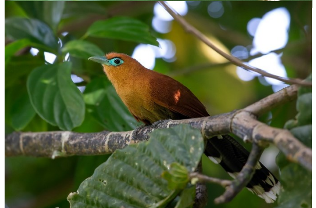
Palawan Peacock-Pheasant, Palawan Flowerpecker, Raffles Malkoha