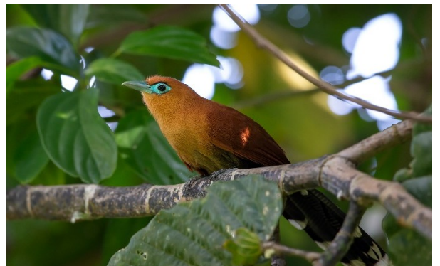
Palawan Peacock-Pheasant, Palawan Flowerpecker, Raffles Malkoha