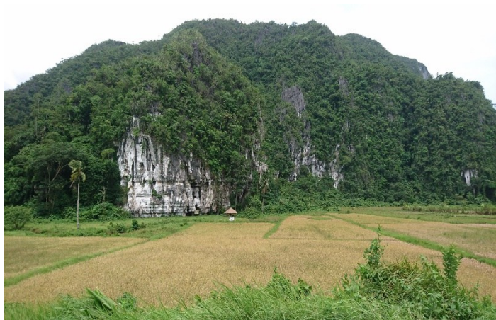
Underground National Park

This morning we visit the remarkable Underground River National Park, a UNESCO-listed site renowned for its dramatic limestone karst landscape and rich biodiversity. Exploring the mangrove-lined waterways and forested trails, we experience a fascinating mix of coastal and lowland forest habitats. The area supports a wealth of birdlife, with regular sightings of Palawan Hornbill and Palawan Drongo, while the surrounding forest provides further chances for a range of endemics — and, with luck, another encounter with the elusive Palawan Peacock-Pheasant.