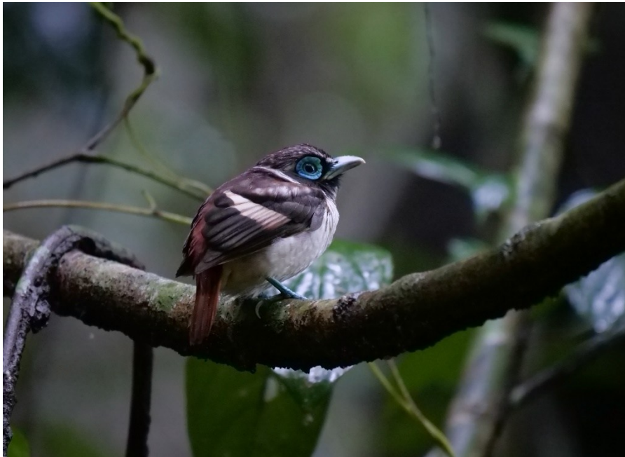
Visayan Wattled Broadbill