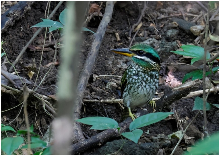
Spotted Wood Kingfisher

A full day is devoted to exploring the excellent birding habitats of Subic Bay, one of Luzon's most rewarding lowland forest areas. We begin early along forest trails, where the morning chorus provides a lively backdrop as we search for key species such as Luzon Hornbill, Tarictic Hornbill and the striking Balicassiao. The mix of tall dipterocarp forest and more open edges supports a rich diversity of birdlife, making for an engaging and productive start to the day.