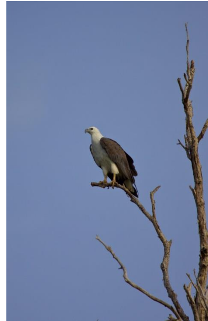
White-bellied Sea Eagle

The Karawari River is a good location for White-bellied Sea Eagle, Brahminy Kite, Oriental Dollarbird, Great-billed Heron, Azure Kingfisher, Red-cheeked Parrot and Pinon's Imperial Pigeon and riparian birds such as Shining Flycatcher and Green-backed Gerygone. But our target species along the river will be Twelve-wired Bird-of-paradise, which we hope to see at its display site. We will also venture into the forest. Lowland swamp forest is the home of the magnificent Victoria Crowned Pigeon, Wompoo and Orange-bellied Fruit-Doves, Hooded Pitta, New Guinea Scrubfowl, White-bellied Thicket Fantail and Ivory-billed Coucal. The nearby hill forest has Yellow-billed Kingfisher, Blue Jewel Babbler, Rusty Pitohui, Ochre-collared Monarch and King Bird-of-paradise. We may also search for secretive and/or uncommon species such as Northern Cassowary, New Guinea Flightless Rail, New Guinea Harpy-Eagle and Magnificent Riflebird. At night we will have the opportunity to spotlight around the lodge for species such as Papuan Frogmouth, as well as a variety of geckos and frogs.