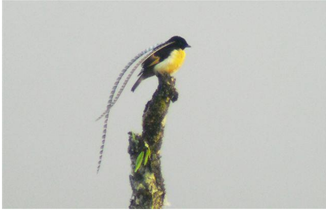
King of Saxony Bird-of-paradise

We will spend a full day birding in the high altitude forest behind Rondon Ridge. Possible species near the lodge, in addition to those mentioned above, include Mountain Fruit-Dove, Goldie's Lorikeet, Orange-crowned Fairywren, Yellow-streaked Honeyeater, Black-breasted Boatbill, Loria's Satinbird, Friendly and Dimorphic Fantails, Wattled Ploughbill, Blue-capped Ifrita, Black Pitohui, Blue-faced Parrotfinch and the elusive and taxonomically enigmatic Mottled Berryhunter (now a monotypic family, Rhagologidae). We will also search for skulking terrestrial species such as Forbe's Forest-Rail, Lesser Melampitta and Lesser Ground Robin. Further afield we