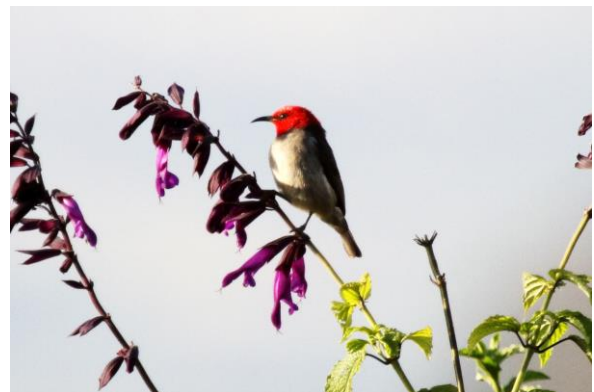
From top: Raggiana Bird of Paradise, Lake Murray and Mountain Myzomela