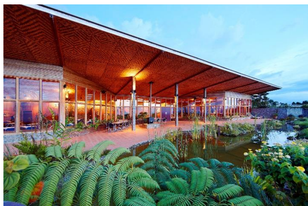
Rondon Ridge Lodge

Today we depart Central Province and fly from Port Moresby to Mount Hagen in the Western Highlands Province. We will be staying for three nights at Rondon Ridge Lodge, one of PNG's premier lodges, located on Mount Kuta and overlooking Wahgi Valley, which has some of the oldest evidence of agriculture anywhere in the world. The lodge is just less than an hour's drive from the airport and we will be accommodated in separate units from where we can enjoy some of the bird-watching available in the surrounding grounds. The cool conditions will be quite a contrast to Port Moresby, (Rondon Ridge is at 2100m), as will be the bird assemblage.