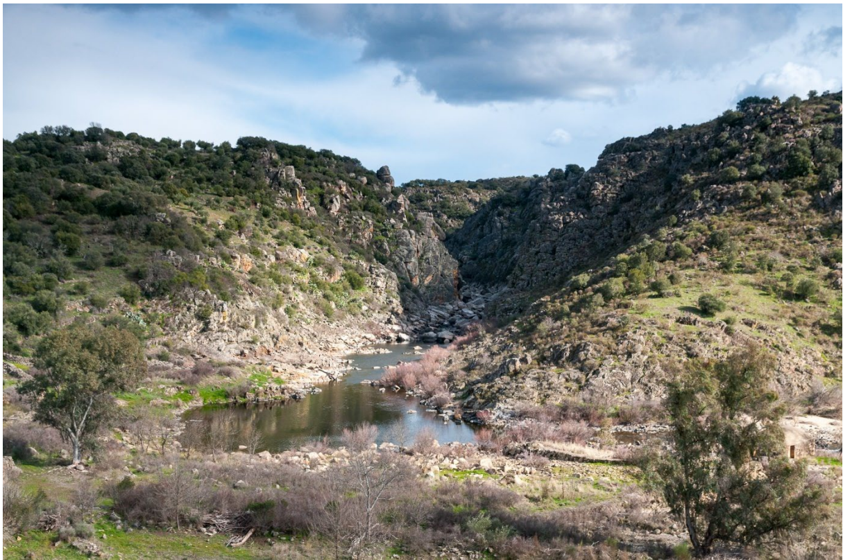
Erges River Canyon

Join the Naturetrek e-mailing list and be the first to hear about new tours, additional departures and new dates, tour reports and special offers. Visit www.naturetrek.co.uk to sign up.