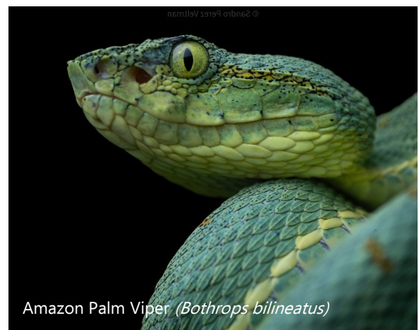
Amazon Palm Viper ( Bothrops bilineatus )