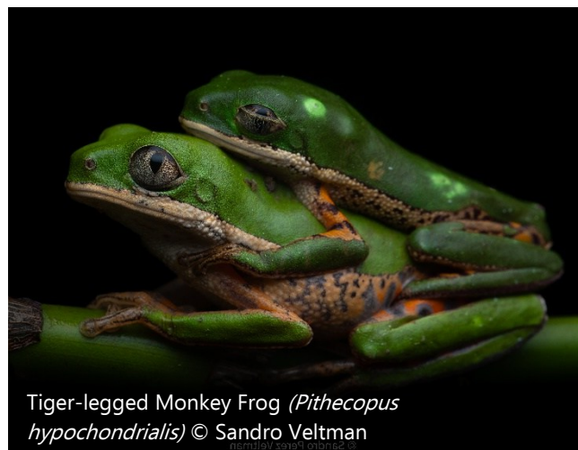
Tiger-legged Monkey Frog ( Pithecopus hypochondrialis )

Following our return from Fredberg, we will undertake an evening excursion within the park. Here we will search for a variety of species, with possibilities including Fer-de-lance ( Bothrops atrox ), Amazon Palm Viper ( Bothrops bilineatus ), Snail-eaters ( Sibon spp. ), and Keelbacks ( Chironius spp. ). Amphibians may include Suriname Toad ( Pipa pipa ), Clown Treefrog ( Dendropsophus leucophyllatus ), and Tiger-legged Monkey Frog ( Pithecopus hypochondrialis ).