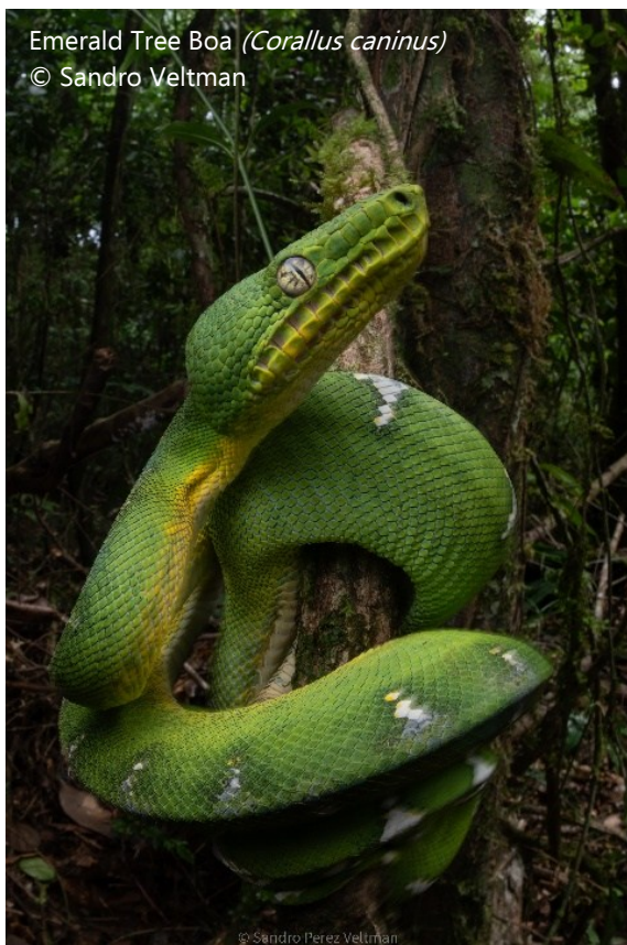
Emerald Tree Boa ( Corallus caninus ) © Sandro Veltman

This morning we fly from Amsterdam to Paramaribo-Zanderij International Airport.