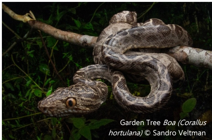
Garden Tree Boa ( Corallus hortulana ) © Sandro Veltman