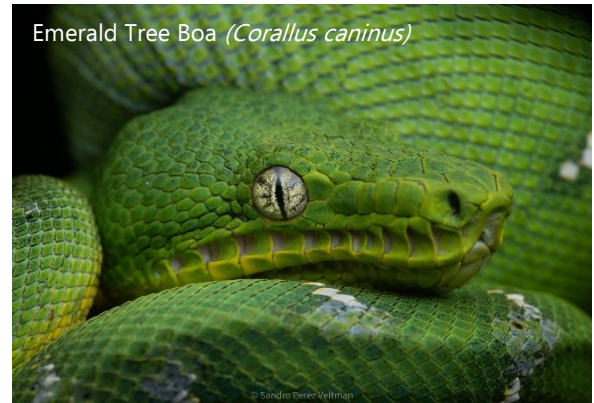
Emerald Tree Boa ( Corallus caninus )