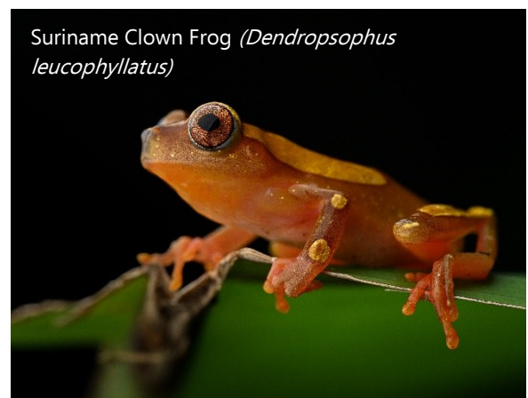
Suriname Clown Frog ( Dendropsophus leucophyllatus )