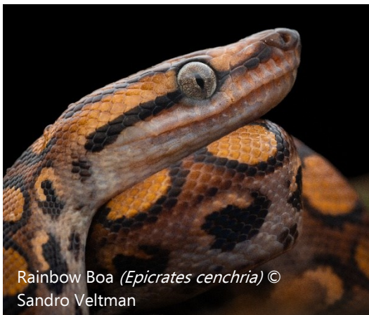
Rainbow Boa ( Epicrates cenchria )

During our three nights in Fredberg we will venture into the dense jungle on daytime and night-time herping excursions, searching for some of Suriname's most captivating species, including the Green Anaconda ( Eunectes murinus ), coral snakes ( Micrurus spp. ), Rainbow Boa ( Epicrates cenchria ), Emerald Tree Boa ( Corallus caninus ) and Garden Tree Boa ( Corallus hortulana ). Fredberg is also a strong hold for the mighty South American Bushmaster ( Lachesis muta ), indeed seen here by a Naturetrek group in March 2026. The combination of river, forest, and creeks makes this an excellent spot for spotting both aquatic and terrestrial species, as well as enjoying the some of the