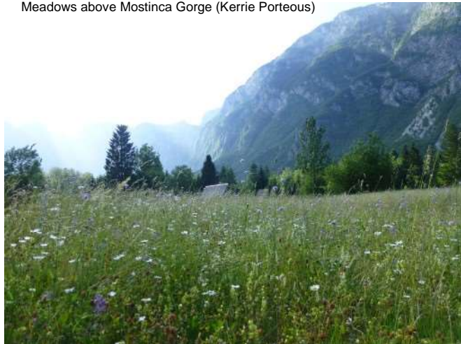
Meadows above Mostinca Gorge

butterflies that this beautiful country has to offer. Wallcreepers live in the mountains on the steep bare cliffs and amongst other birds we will hope to see are Alpine Swift, Alpine Chough, and Black Woodpecker (which is quite common in the forests). The Three-toed Woodpecker is also a possibility, although rare. Butterflies that we will look out for include Scarce and Purple-edged Copper, Woodland Brown, False Heath & Spotted Fritillary. Red and Roe Deer, Wild Boar and Chamois inhabit the forests in good numbers, although Brown Bear, and Wolf are rare and are only seen by the very lucky few! In the National Park, meanwhile, there are also Alpine Ibex, Marmots and Golden Eagles to be found. Farming is traditional, with sheep (kept mainly for cheese making) grazing in high altitude meadows while many of the meadows lower down have strange-looking racks, called kozolec, to dry the hay, unique to parts of Slovenia. The people are most friendly and helpful and many, especially the young, speak very good English.