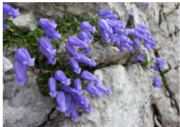
Mountain Avens, Carnic Lily, Zois' Bellflower