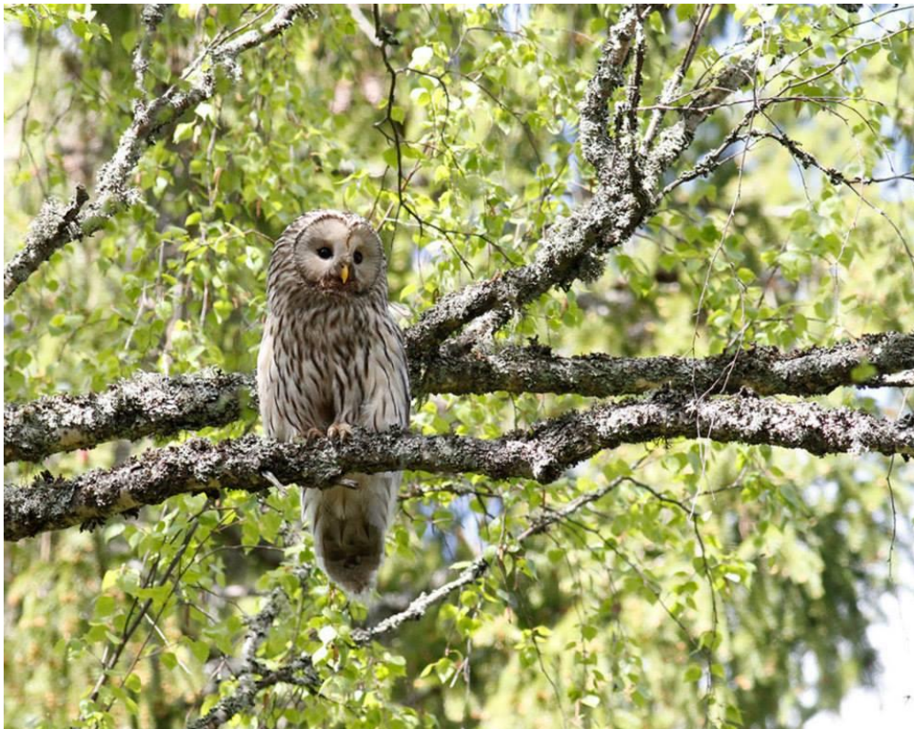
Female Ural Owl

Join the Naturetrek e-mailing list and be the first to hear about new tours, additional departures and new dates, tour reports and special offers. Visit www.naturetrek.co.uk to sign up.