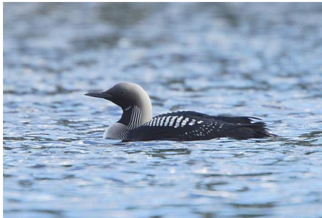
Black-throated Diver

The extensive forests of pine and spruce hold healthy, but secretive, populations of Black Grouse, Capercaillie and Hazel Grouse, the latter often best located by their piercing high pitched whistle. Pied Flycatchers and Redstart are also common here – and more easily seen – along with Willow Tit, Crested Tit, Wood Warbler, Tree Pipit, Cuckoo and Northern Bullfinch. There are also a few butterflies to look out for including Camberwell Beauty, Holly Blue and abundant Green Hairstreaks. Dotted