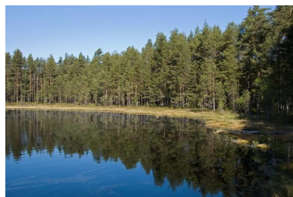
Images from top: Great Grey Owl, Ruff, Svartådalen