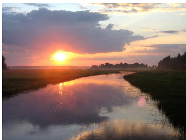
Sunset over Svartadalen

By mid-May northward migration will be in full swing. Wetlands, such as Lake Fläcksjön, are a magnet to a variety of northbound waders including Ruff, Spotted Redshank, Wood Sandpiper and Greenshank. Even Great Snipe have even been found passing through the region in recent years! The fringing reedbeds are home to Bitterns and warblers. These reedbeds are in turn bordered by extensive meadows – many awash with early spring flowers – which hold breeding Whinchat and Yellow Wagtails, over which Hobbys swoop for dragonflies and Goshawks frequently soar.