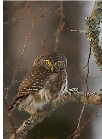
Pygmy Owl (Michael Bergman)

Later in the evening - either before or after dinner - we will go in search of Great Grey and Pygmy Owls. Following a drive of approximately 45 minutes (during which we have a good chance of seeing Elk), we will position ourselves on the edge of the forest, overlooking a meadow, and await the star attraction of our weekend. Over the last 10 years several pairs of Great Grey Owls have moved south into the forests bordering Svartådalén and one particular pair have become especially tolerant of people, often perching, unconcerned, within several metres of their human admirers. The sight of a Great Grey Owl perched on a post or swooping low over a meadow must be one of the most breathtaking in the avian world. They frequently emerge to hunt in broad daylight and are sure to leave us all entranced by their piercing yellow eyes and mesmerising beauty! Having marvelled at one of Europe's largest owls, we turn our attention to the smallest. Pygmy Owls are no larger than a Starling and tend to emerge just before dark. Although difficult to find, Daniel knows exactly where to look and we will end our day in search of this diminutive predator.