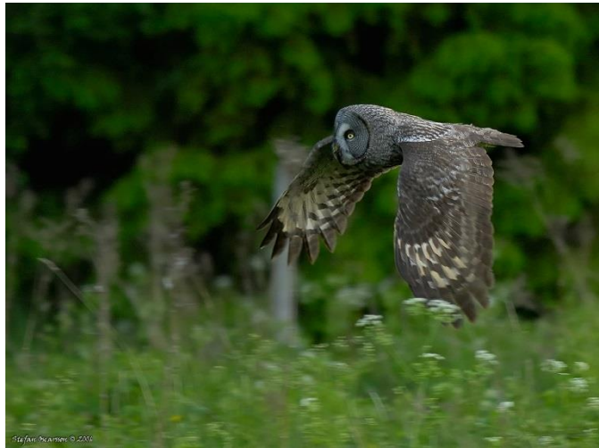
Great Grey Owl (Stefan Oscarsson)

This spring, why not head north with the migrants on this wonderful short break to central Sweden? Within a couple of hours of leaving the noise and bustle of Heathrow Airport you can be exploring a peaceful rural landscape of forests, lakes and wet meadows, the silence only broken by the trumpeting of a passing flock of Cranes, the 'Crex Crex' call of a Corncrake, or the lively song of a Thrush Nightingale. The patchwork of habitats within and around Svartådalén (the Black River Valley) are home to an exciting variety of northern birds. Here we find ourselves at the southernmost fringes of the boreal forests, that great carpet of conifers - dotted with a myriad lakes - that stretch north to the tree-line and then east and west to wrap the planet's northern-most latitudes in a swath of green. Whilst birds such as Three-toed Woodpecker, Capercaillie and Hazel Grouse are much appreciated by UK birders, the most sought-after denizens of these northern forests are the owls. Here live the great and the small of the owl world, from the diminutive Pygmy Owl to the majestic Great Grey and Eagle Owls. Add to these extremes Ural, Tawny, Long-eared and Tengmalm's Owls, plus an exciting supporting cast of woodpeckers, warblers and waders, and you have the makings of an unmissable long weekend of boreal birding.