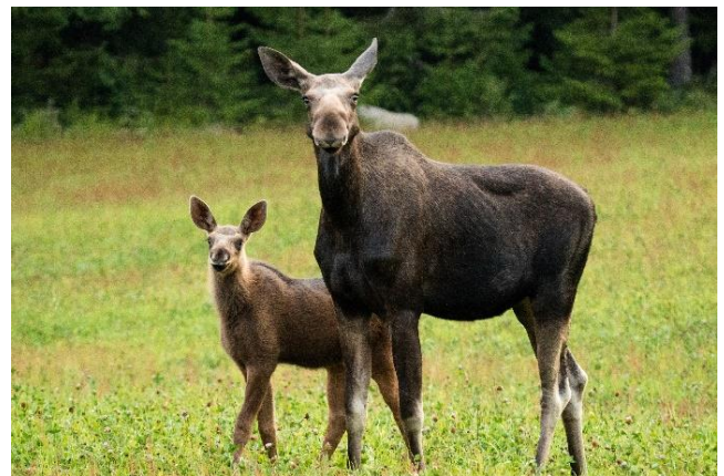
From top: Grey Wolf howling (Skogens Konung), Swedish Wilderness, Elk (Simon Green).