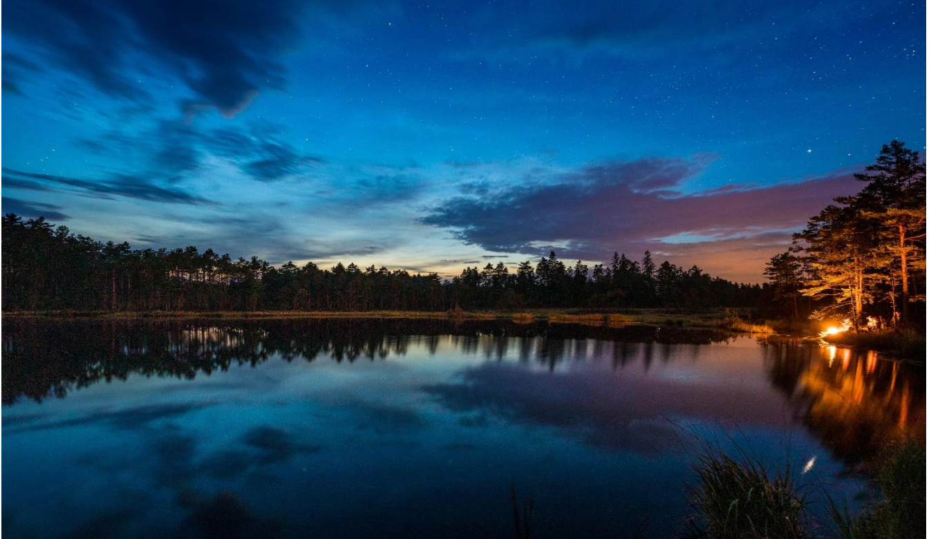
Enjoying Swedish Wilderness around a campfire

Join the Naturetrek e-mailing list and be the first to hear about new tours, additional departures and new dates, tour reports and special offers. Visit www.naturetrek.co.uk to sign up.