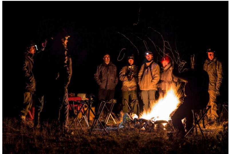
Camp Fire Dinner

It will soon be time to head out together once more and today we will take a picnic from Färna Manor to enjoy out in the field. We will then enjoy a lovely afternoon walk in a nearby nature reserve, exploring beautiful, old growth forest. This will likely be at either Utterdalen, Lappland or Ormdalsleden Nature Reserves and it will depend on where our guides feel there is the best chance to see species we may not have already encountered. We will be staying out on foot and will likely be walking for around two hours with breaks and stopping and starting as we find wildlife.