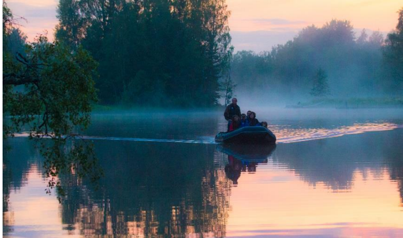
Beaver excursion at dusk (Jan Nordstrom)

Please note that as most mammals generally appear around dusk and wolf-howling is carried out after dark, there will be some late nights on this tour. We often stay out until after midnight as it stays light very late here, but we will enjoy a late breakfast the next day and our mornings will be taken at a much more leisurely pace.