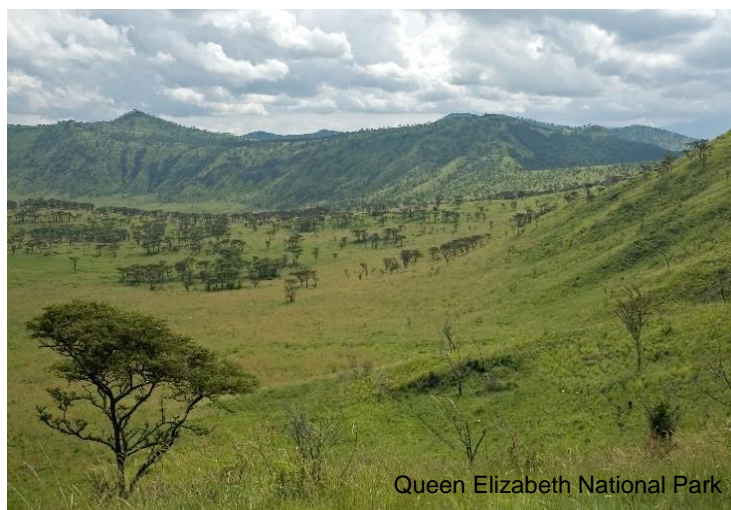
Queen Elizabeth National Park

Described by Winston Churchill as 'the pearl of Africa', Uganda is a small landlocked country supporting a wide range of animal species, reflecting its diversity of habitats and transitional point between the East African savannah, the West African rainforest and the semi-desert to the north. Uganda has a lot to offer the wildlife enthusiast and is happily rising in popularity following years of political unrest. Tourists are welcomed and are increasingly being catered for all over the country, indeed Uganda is one of Africa's most friendly destinations!