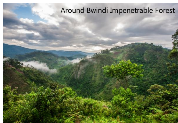
Around Bwindi Impenetrable Forest

The Bwindi Impenetrable Forest is one of Africa's most extensive belts of primary montane forest. Its exceptional altitudinal variation - rising and falling from deep river gorges and low hills at 1,200 metres to high forested ridges at 2,500 metres - ensures a unique range of flora and fauna, in particular primates and birds.