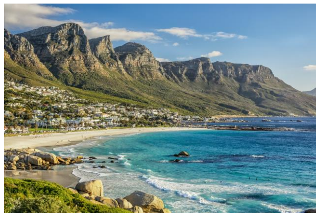
Images from top: Newlands Cricket Ground, Cape Sugarbird & Cape Peninsula