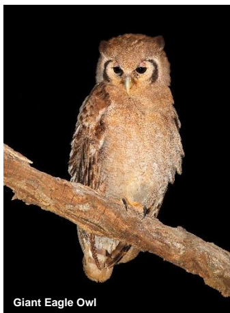
Giant Eagle Owl

which leaves around 1600 hours and returns between 1930 hours and 2000 hours (Zambia being one of the few countries that permit night safaris within their national park boundaries) and provides a great opportunity to see such nocturnal mammals as African Civet, Large-spotted Genet, Cape Porcupine, Honey Badger, Scrub Hare, White-tailed, Bushy-tailed and Slender Mongooses, Lesser Bushbaby and, if very fortunate, perhaps the bizarre Aardvark. Above all, such drives offer the best chance of seeing the elusive Leopard and perhaps a pride of hunting Lions or a clan of scavenging Spotted Hyena. Nocturnal birds include Mozambique and Pennant-winged Nightjars, Spotted and Verreaux's Eagle-Owls and, occasionally, the rare Pel's Fishing Owl.