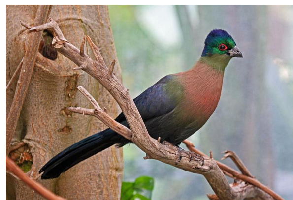
From top: Southern Carmine Bee-eaters, Lions & Purple-crested Turaco