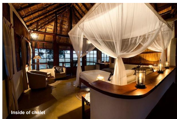
Inside of chalet