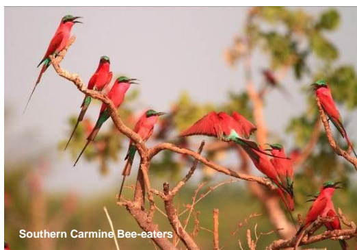
Southern Carmine Bee-eaters

banded Courser, White-crowned Plover, Lilian's Lovebird, Grey and Purple-crested Louries, various cuckoos such as Jacobin, Striped, Black, and the beautiful Emerald Cuckoo, Woodland Kingfisher, White-fronted Bee-eater, Paradise and Broad-tailed Paradise Whydahs, Spotted-backed Weaver and many more. Southern Carmine Bee-eaters arrive to breed in August or September and should still be around during the latter part of the year, whilst around the lodge it is possible to find Collared Palm Thrush, White-browed Robin-chat and Terrestrial Bulbul.