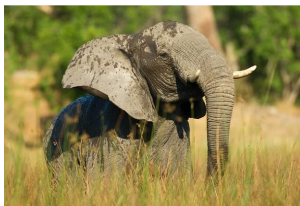
Images from top: Leopard, Nkonzi Bush Camp tent and African Elephant, Courtesy of Paul Stanbury, Gavin Opie and Shutterstock