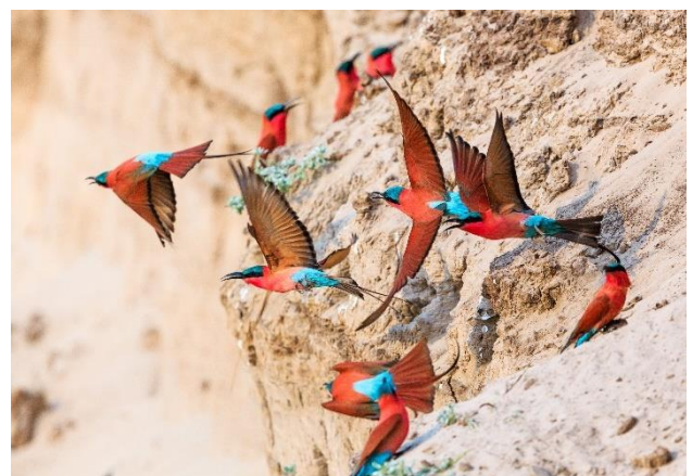
Images from top: Chikunto Safari Lodge, Leopard & Southern Carmine Bee-eaters Courtesy of Shutterstock Images & Gareth Jones.