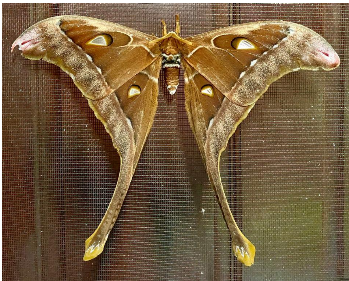
A magnificent Hercules Moth – the world's largest moth.

Then, the day provided the major highlight of the trip: Southern Cassowary! Fortunately for us, it crossed the road directly in front of us as we were leaving the Daintree. This magnificent bird stopped beside the road, so we could all have a good look. Southern Cassowary are such incredible birds: they stand at the height of a man. They have an incredible presence, and within minutes of us seeing this bird, a dozen or so cars had also stopped to have a look. They are truly the rock stars of among Australian birds.