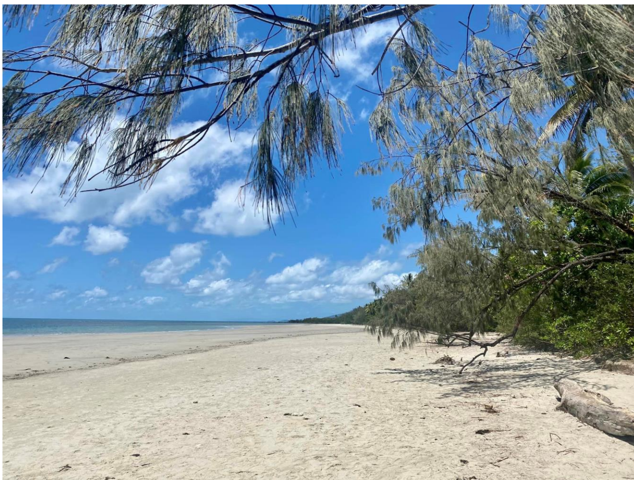
Cape Tribulation – the coastline where Captain Cook first sighted Australia in 1770

tours say they are their favourite Australian birds. Other birds at Kingfisher Park included Grey Whistler, Metallic Starling (hurtling through the property), Cryptic Honeyeater, Yellow-breasted Boatbill, and Spectacled and Black-faced Monarch.