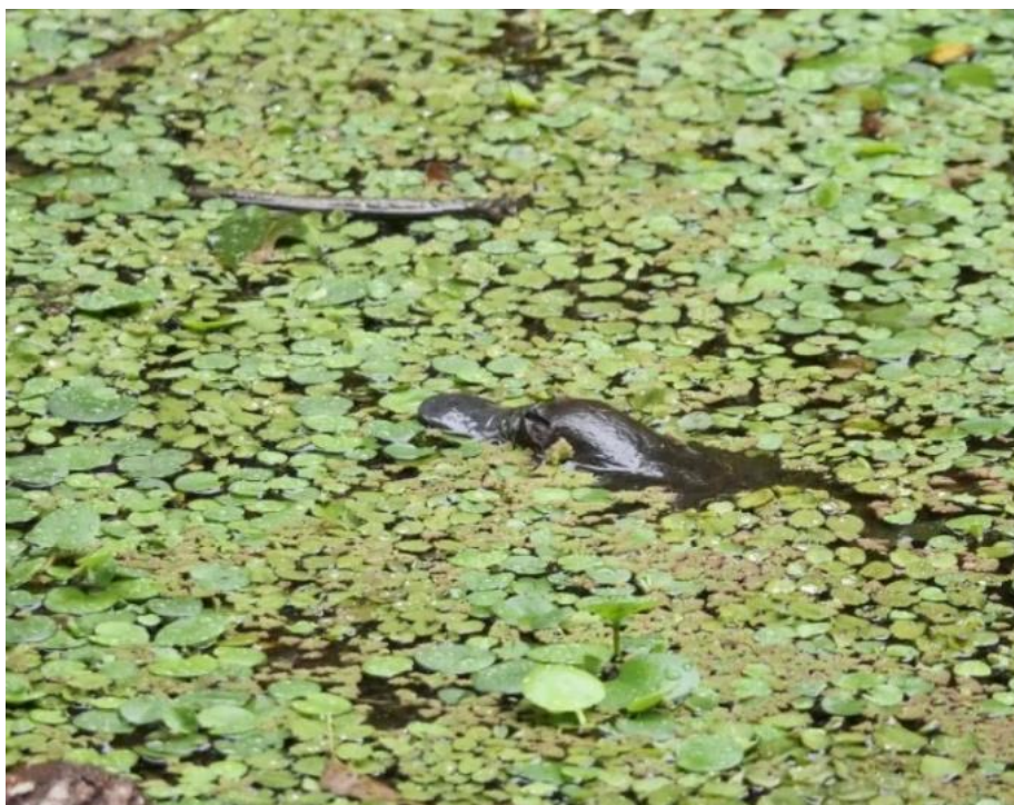
Platypus – a pair was swimming along Petersen's Creek in the Atherton Tableland

Along the creek, there was also a colony of Spectacled Flying-fox, as well as birds such as Black-faced and Spectacled Monarch, Pale-yellow Robin, Golden Whistler, and Scarlet Honeyeater.