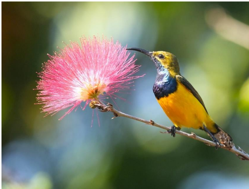
Olive-backed Sunbird – one of the birding highlights from our stay in Yungaburra, Atherton Tableland

At Cairns Botanical Garden, waterbirds included Radjah Shelduck, Magpie Goose, Royal Spoonbill Australian Darter, Little Pied and Little Black Cormorant, and three species of egrets. The surrounding trees yielded Yellow Oriole, White-breasted Woodswallow, Black Butcherbird, Olive-backed Sunbird and Spangled Drongo.