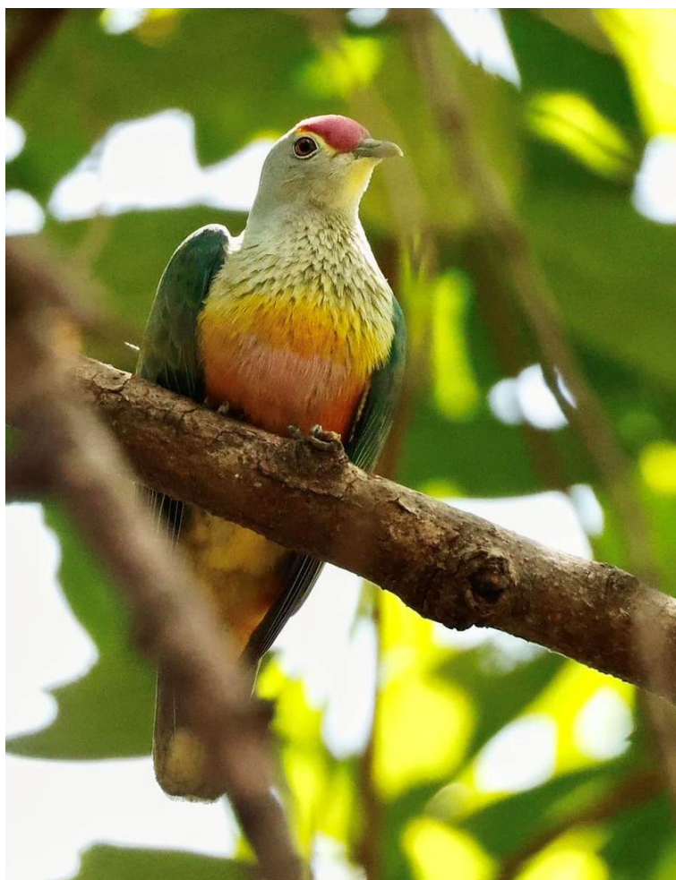
Rose-crowned Fruit-Dove – there were several two roosting at the north end of the Cairns Esplanade.

In the central part of the Esplanade, a dozen or so Varied Honeyeater called loudly as they flew from tree to tree. A pair of Double-eyed Fig-Parrot flew past, and flying above were Torresian Imperial-Pigeon and White-bellied Woodswallow. Several Masked Lapwing paraded on the grass (northern subspecies V. m. miles - with longer legs and a larger mask), as well as half a dozen families of Bush Stone-curlew. A pair of Laughing Kookaburra made an appearance, and seeing Spangled Drongo is always excellent value. Finally, towards the end of the Esplanade, we managed to find two Rose-crowned Fruit-Dove, certainly one of Australia's prettiest birds!