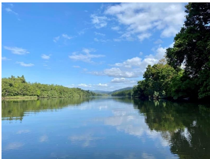
Daintree River near Daintree Village

After an excellent breakfast, we headed to Mount Hypipamee, one of the Australia's best areas of high-altitude rainforest. Here we saw Bridled Honeyeater, Mountain Thornbill, Brown Gerygone, Atherton Scrubwren, Eastern Yellow, Pale-yellow and Grey-headed Robin, Spotted Catbird, and Wompoo Fruit-dove (high in the canopy), but the absolute highlight was a male Victoria's Riflebird: for everyone in the group, this was their first Bird-of-Paradise!