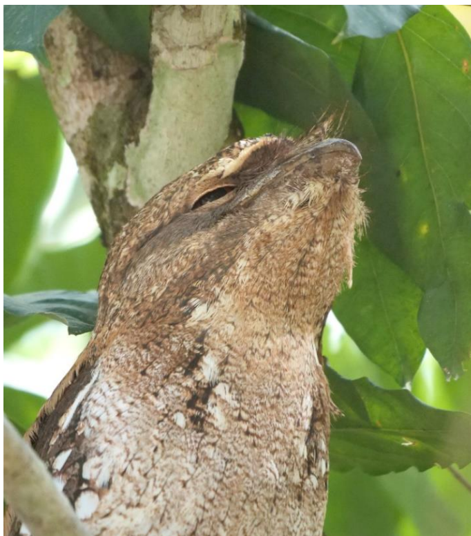
Papuan Frogmouth – the world's largest frogmouth, Kingfisher Park

From there, we headed across the Daintree River by car ferry, venturing into the incredible Daintree Rainforest, the world's oldest rainforest and a World Heritage Area. This is where the rainforest meets the sea and is bordered by the Great Barrier Reef, also a World Heritage Area. After lunch at the Daintree Visitor Centre, we walked a couple of the trails at the centre and walked up the five-storey-high viewing tower, which provides wonderful views across the rainforest. The highlight here was Wompoo Fruit-dove and a Musky Rat-kangaroo, the smallest member of its family.