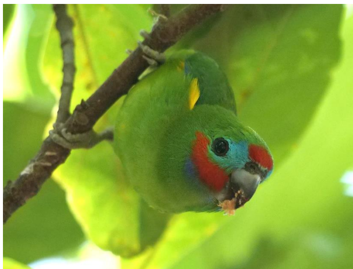
Double-eyed Fig-Parrot feeding on Cluster Figs – Cattana Wetland, Cairns

At the end of the day, we headed to the beautiful township of Yungaburra, known for being a birdwatcher's paradise. Successful birding tours spend at least two nights there, and we were lucky to be spending three!