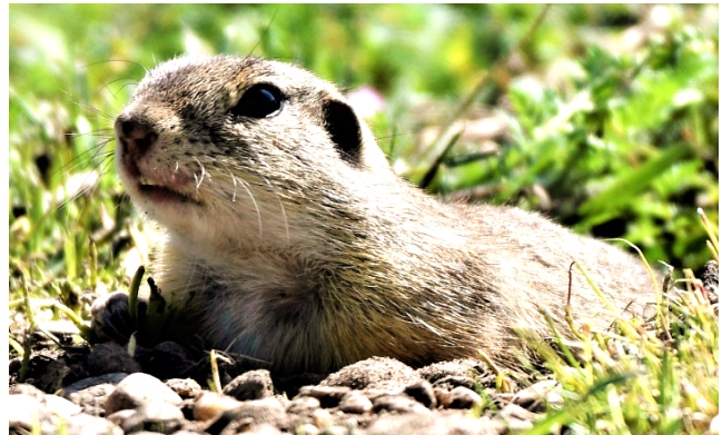
European Suslik