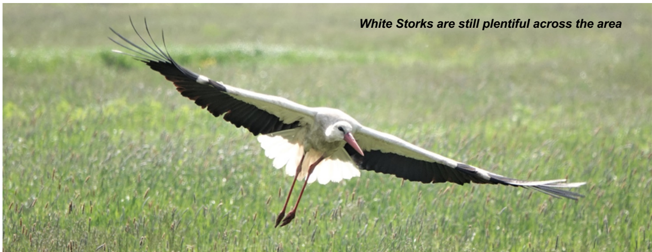
White Storks are still plentiful across the area

After breakfast, we congregated by the bus and we were immediately entranced by a flyby of a dozen or so Bee-eaters. We climbed aboard and headed out for a morning walk on the eastern side of Lange Lacke, the largest of the Seewinkel lakes. Although a shadow of its full extent the lake still held some water and in a sunny, but breezy, morning we headed to the water. In the surrounding grassland we were met by a blaze of colour from the flowering plants and the song of Skylarks in the surrounding grasslands. Key amongst these were number of Early Spider and Green-winged Orchids. More careful inspection showed a wide range of flowers that would become familiar during our stay with swathes of salvias, flaxes and mulleins. Graylags were ever present and the pool held plenty of Mute Swans and Shelduck, however it was the Montagu's & Marsh Harriers that grabbed our attention. The wet edges held a mix of waders. The Lapwing and Redshank are local breeders, but the Ruff, Dunlin and Avocets were migrants. We soon headed on towards Zicksee, across agricultural fields holding both species of deer & Hares. A large raptor made us make an impromptu stop, and we soon were watching an Eastern Imperial Eagle being driven away by a Buzzard.