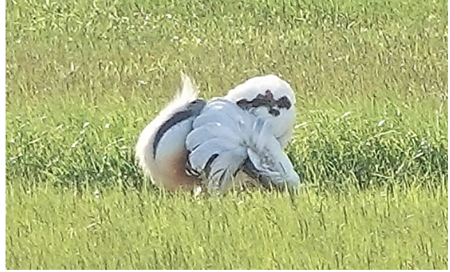
Displaying Great Bustard