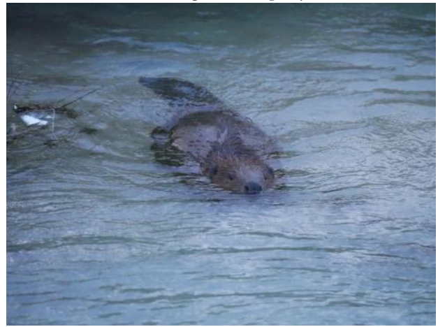
Beaver