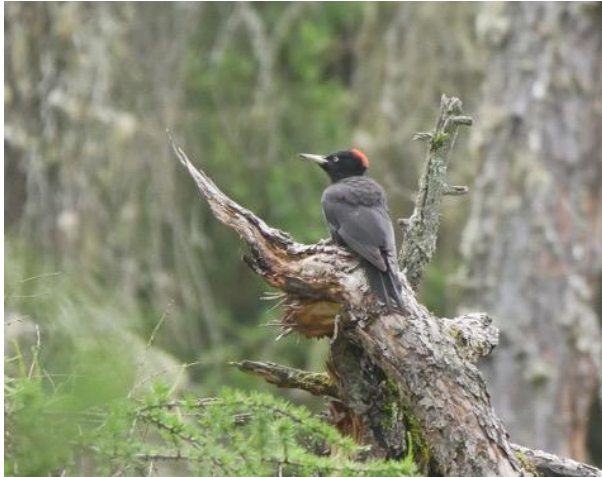
Black Woodpecker by Keith Buchanan