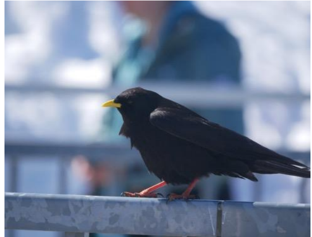
Alpine Chough