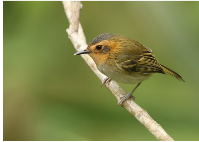
Ochre-faced Tody Flycatcher