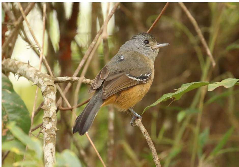
Female Variable Antshrike

It was a slow start but we did manage to pick up a pair of Variable Antshrikes followed by much better views of a Half-collared Sparrow for everyone, a vast improvement on the bird we had seen yesterday. Next up was a Long-tailed Tyrant followed by great views of a Ferruginous Antbird and an Ochre-faced Tody-Flycatcher. A rather wet and miserable Magpie Tanager was spotted followed by nice views of a pair of White-collared Foliage-gleaners. Our next new bird of the day was a Rufous-crowned Greenlet and a female White-shouldered Fire-eye, Euler's Flycatcher, Dusky-legged Guan, Green-backed Becard and a Rough-legged Tyrannulet followed. In the distance some 20+ White-eyed Parakeets flew over whilst we were using playback for White-bearded Antshrike, with unfortunately no response. We set off along the track and were watching a Golden-crowned Warbler when one of the group said they had a bird that was brown with a black and white head.... We dashed over and sure enough, there it was, a beautiful male White-bearded Antshrike which showed incredibly well for everyone!