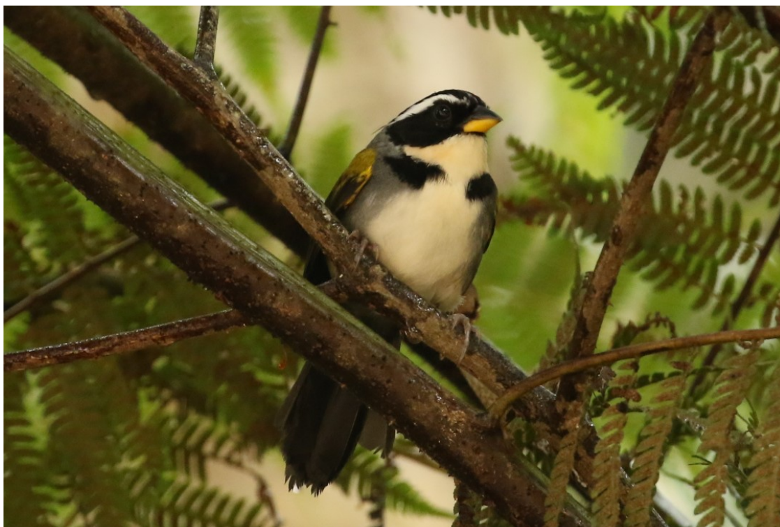
Half-collared Sparrow (Andy Foster)

After breakfast we departed for a day's birding at Macae de Cima, a track that runs through some beautiful primary forest. We stopped briefly outside of the lodge grounds to get some excellent views of a pair of Half-collared Sparrows, a great start!