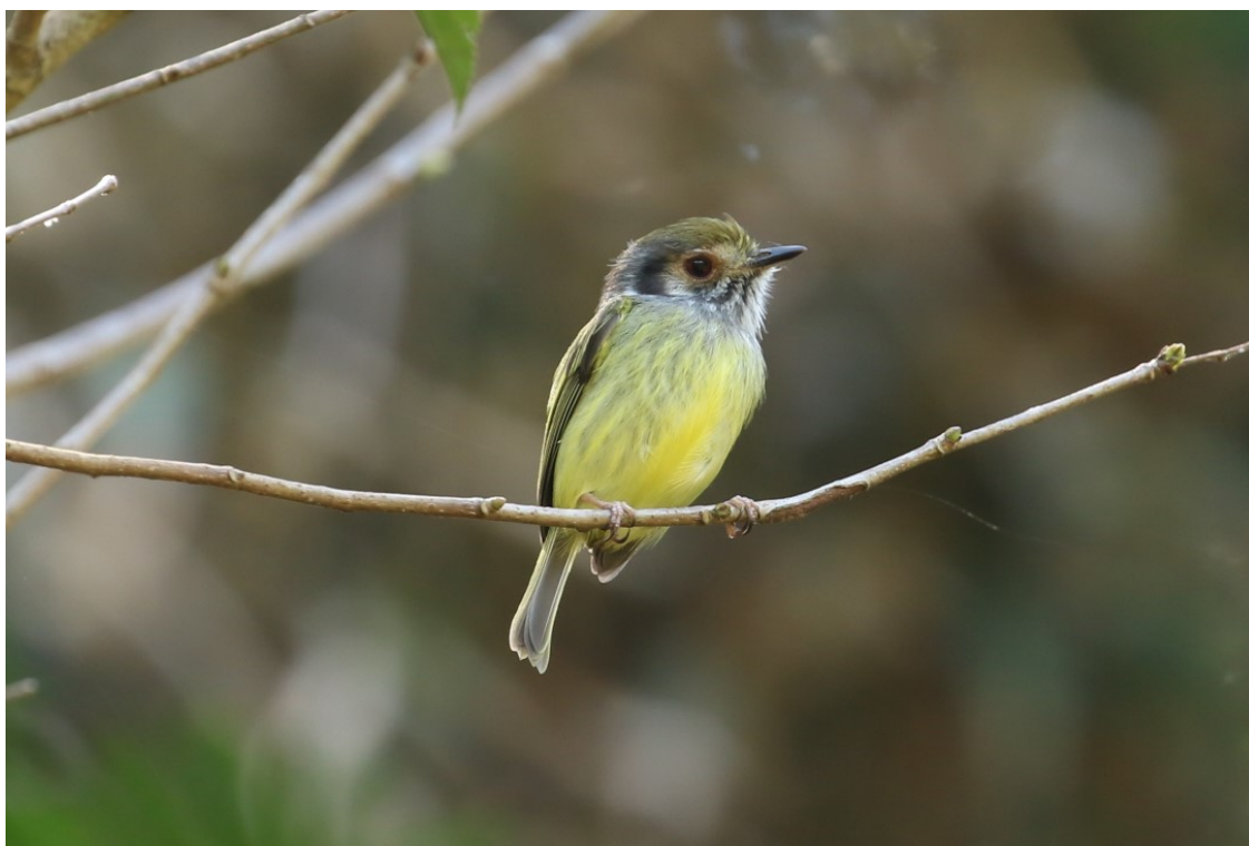
Eared Pygmy-Tyrant (Andy Foster)

With clouds building and the possibility of rain we drove to one of our most productive spots, arriving around 11.30. As usual, this didn't disappoint and during the next hour we had some fantastic birding. It all started with a pair of Bertoni's Antbird and good views of a couple of Yellow Tyrannulets. I used some playback for Saffron Toucanet and approximately 10 minutes later, we were enjoying some great views of this wonderful bird! At the same spot, we also managed to pick up good views of Green-winged Saltator and Black-throated Grosbeak.