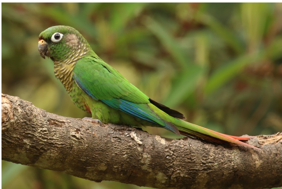
Maroon-bellied Parakeet on the Itororo lodge feeders

Arriving at 12.30 we quickly unloaded the minibus and allocated rooms to everyone and whilst the final preparations were being made for lunch, we got to work identifying some of the birds coming into the feeders. These included Brassy-breasted Tanager, Ruby-crowned Tanager, Golden-chevroned Tanager, Brazilian Ruby, Great Kiskadee, White-throated Hummingbird, Plain Parakeet, Maroon-bellied Parakeet, Dusky-legged Guan, Burnished-buff Tanager and Slaty-breasted Wood-Rail.