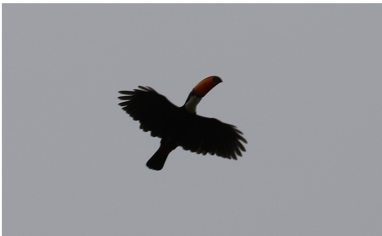
Toco Toucan

We arrived into the little square of Duas Barras and stopped at a local bakery for some coffee and cake and to use the facilities! Feeling refreshed we continued our journey and at our next stop picked up Cliff Flycatcher, Rufous Hornero, Black-capped Donacobius, White Woodpecker, Firewood Gatherer, Rufous-fronted Thornbird, Bran-coloured Flycatcher, Campo Flicker, Yellow-chinned Spinetail, Shiny Cowbird, Aplomado Falcon, Giant Cowbird, Cattle Tyrant, Wing-banded Hornero, Guira Cuckoo, White-eared Puffbird, Brazilian Teal and to round things off nicely, four Red legged Seriemas! What a fantastic spot!