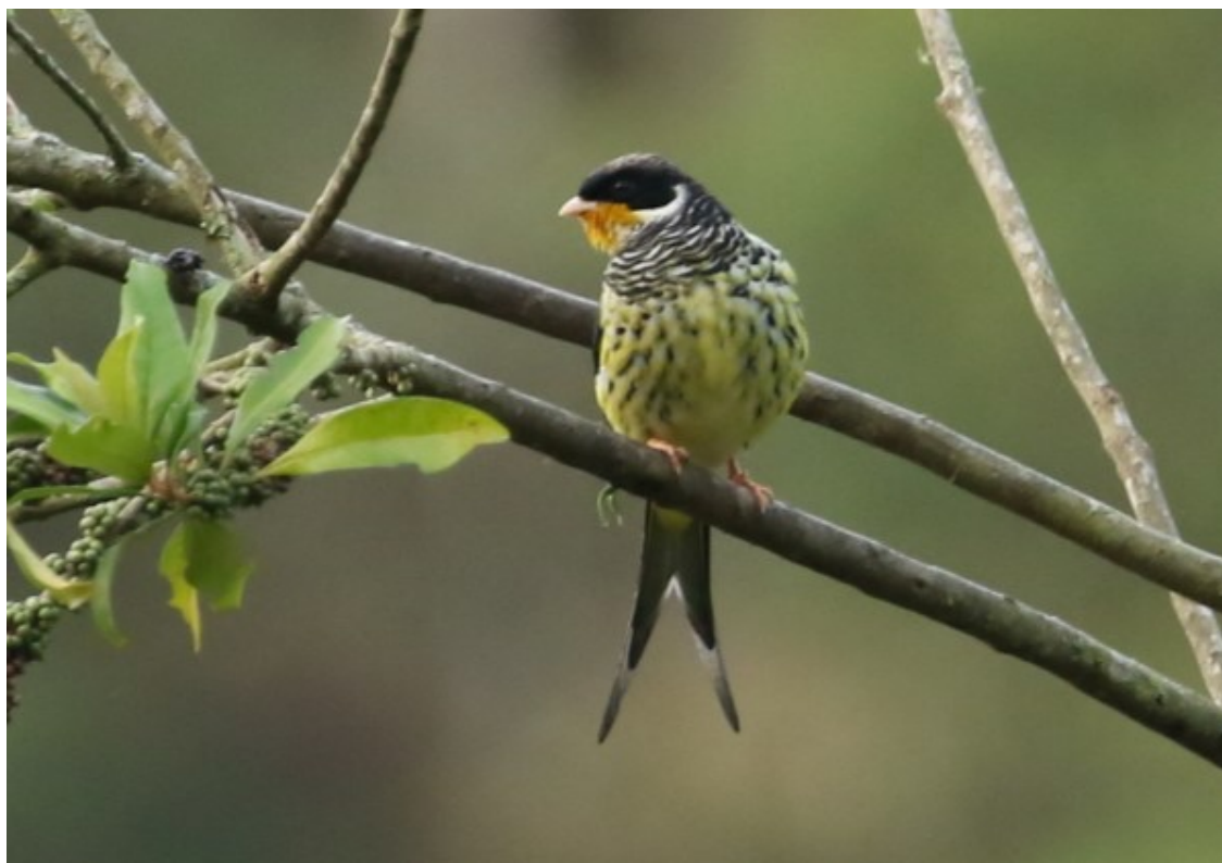
Swallow-tailed Cotinga (Andy Foster)

We slowly made our way towards the trails in the forest picking up Crested Oropendola, Shear-tailed Gray Tyrant, Gilt-edged Tanager, Swainson's Flycatcher, White-throated Woodcreeper, Planalto Woodcreeper and amazingly a Gray-bellied Spinetail for the whole group!