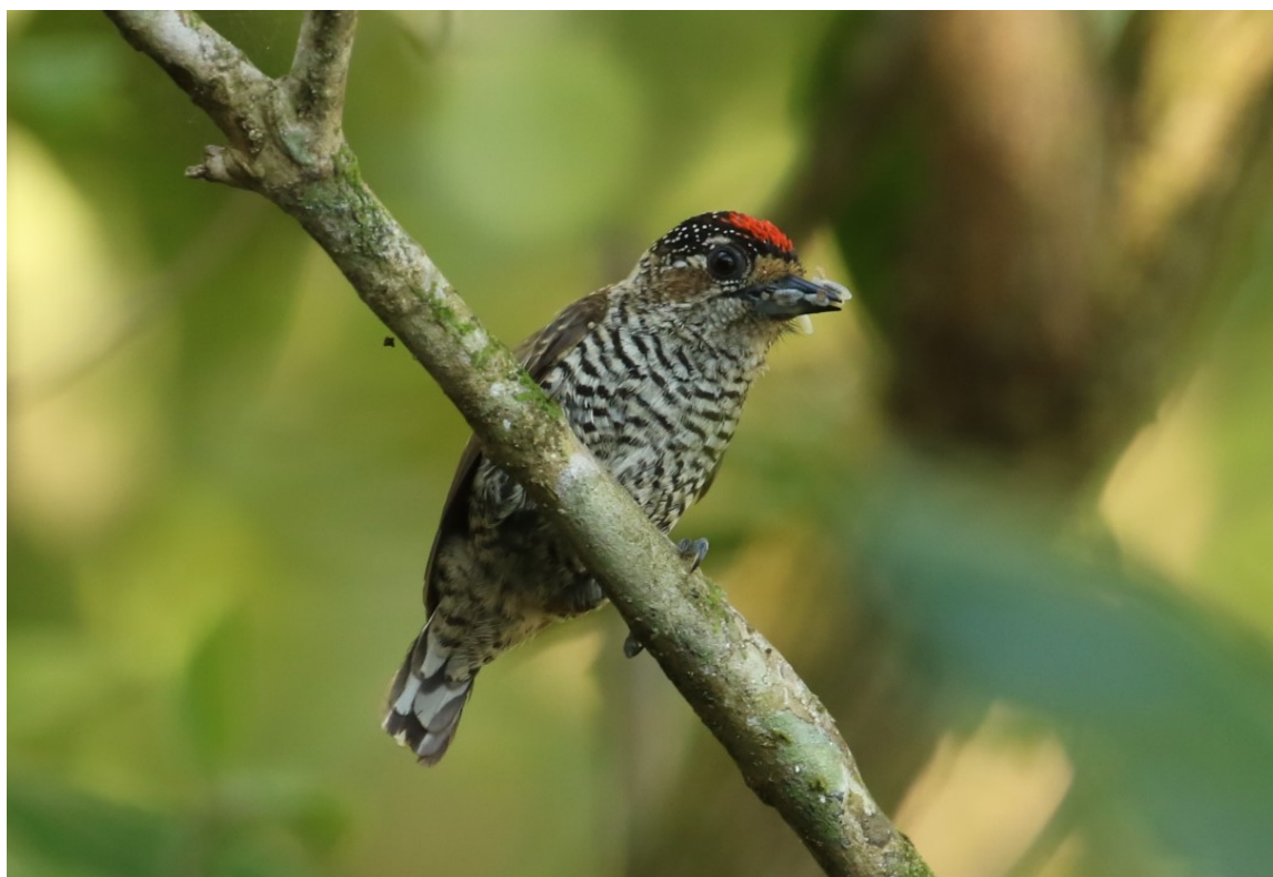
White-barred Piculet (Andy Foster)

We returned to the lodge for lunch and had a short break during the hottest part of the day before heading out to bird around the wetlands at 14.30. For some unknown reason it turned out to be a very quiet afternoon with few birds seen or heard. Species of note included Reddish Hermit, Saw-billed Hermit, Yellow-backed Tanager, White-bearded Manakin, White-barred Piculet and a rather nice Green Whip Snake. We arrived at the lodge at 17.30 and had a short break prior to dinner.