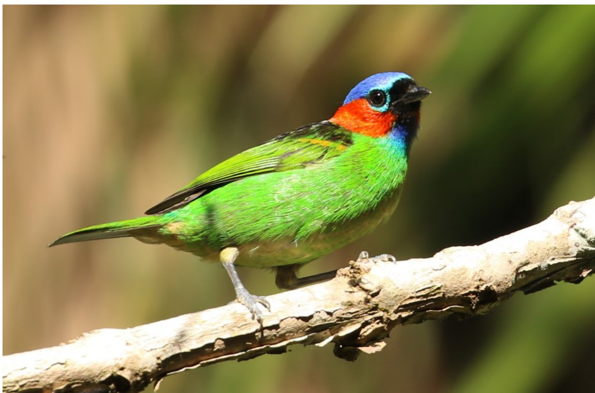
Red-necked Tanager

Ani, Channel-billed Toucan, Rufous-sided Crake, a beautiful Reddish Hermit that hovered in front of us, just like a tiny insect, Versicoloured Emerald, Amazon Kingfisher, Chestnut-vented Conebill, Lesser Yellow-headed Vulture and Black-crowned Night Heron.