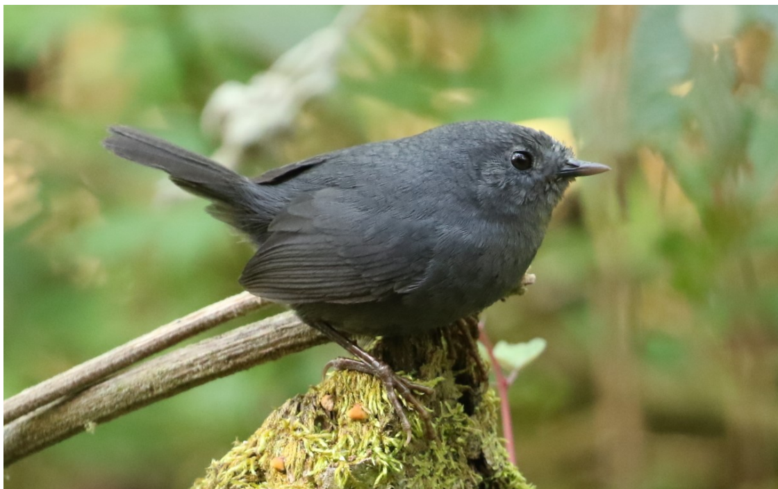
Mouse-coloured Tapaculo