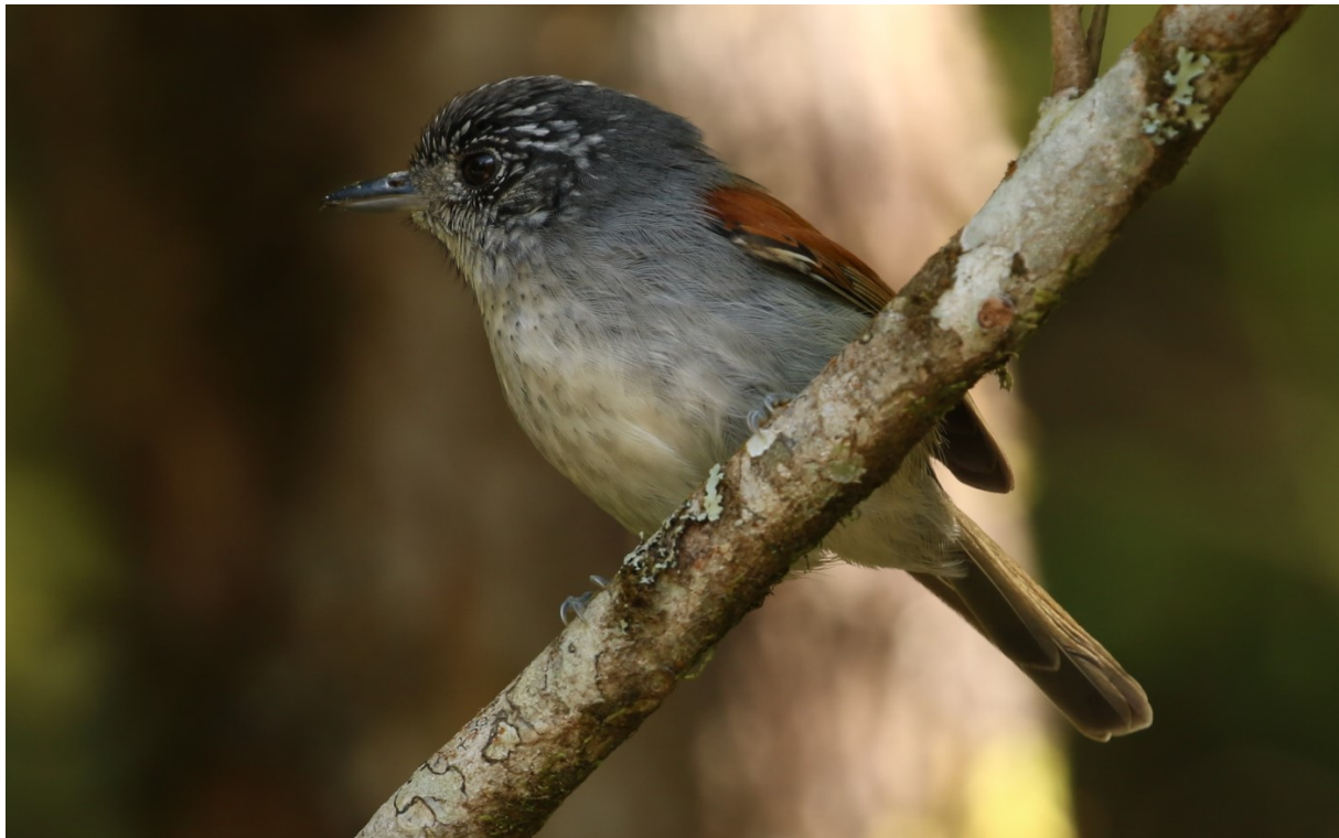
Rufous-backed Antwreio (Andy Foster)

As we climbed higher up the mountain the weather started to change as thick cloud blew in and it started to rain, but undeterred we used some playback for Large-tailed Antshrike and some 15 minutes later were having fantastic views of a female perched up in a bush in front of us.