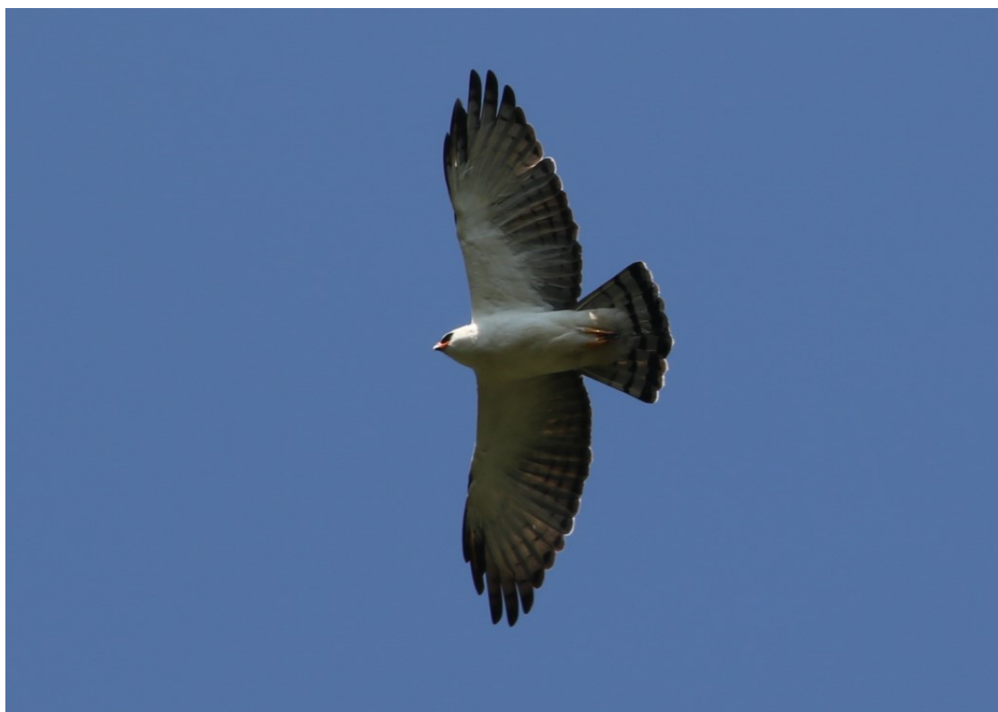
Black and White Hawk Eagle (Andy Foster)