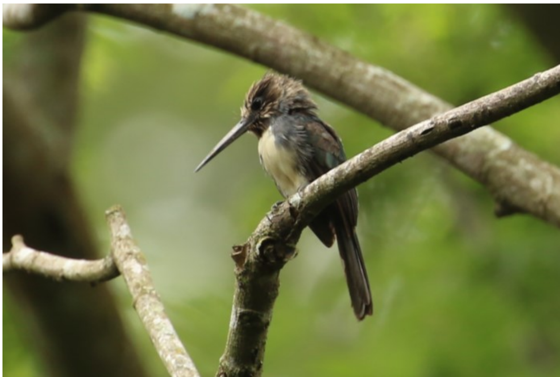
Three-toed Jacamar (Andy Foster)

We started the 1.5 hour drive back towards the lodge, coming across some heavy rain as we arrived in Nova Friburgo; we had indeed been very lucky with the weather! We had some tea, coffee and cake upon arrival before having a short break prior to dinner being served at 18.30, followed by our daily checklist. We had seen exactly 100 species today!