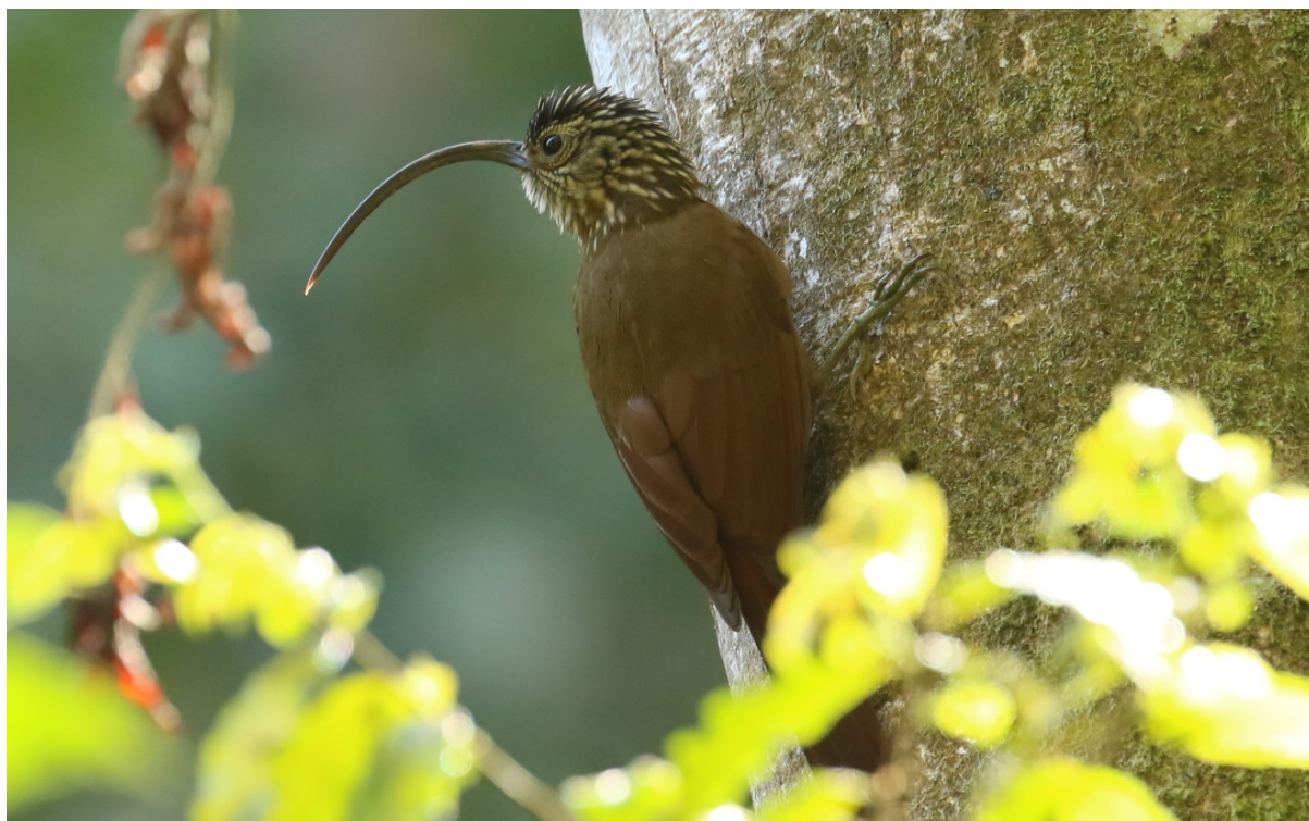
Black-billed Scythebill (Andy Foster)

started the drive back towards the main road, with several stops along the way. Unfortunately, the weather had now started to deteriorate with stronger wind and some rain, so the birds had become unresponsive. We returned to the lodge just before 17.00, had some tea, coffee and cake and then met up again at 18.00 to complete our daily checklist which was followed by dinner.