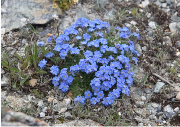
King of the Alps Eritrichum nanaum