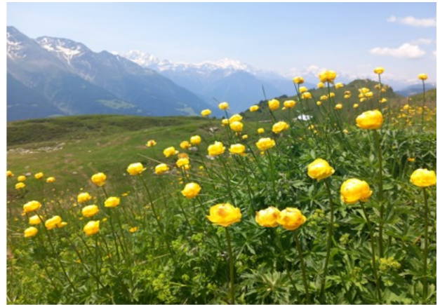
Globeflower Trollius europaeus