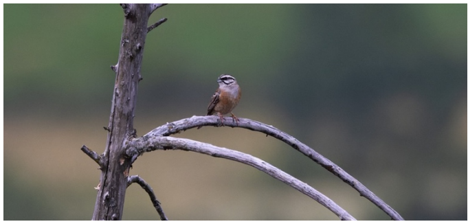
Red-underwing Skipper & Rock Bunting