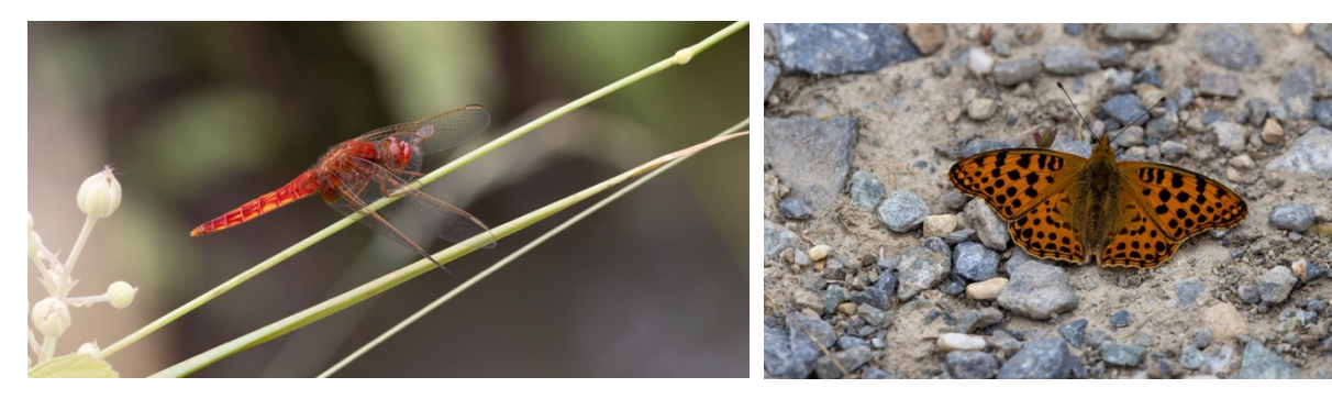
Scarlet Darter and Queen of Spain Fritillary

Ringing the changes today, we drove downhill into the Rhone valley then east to an area of open fields and a golf course near Leuk, known as the Leukerfeld. Here a small nature reserve has been protected and is remarkable in its wealth of wildlife, both birdlife but also dragonflies. Immediately on arrival we could hear Reed Warblers singing and saw several Tree Sparrows along the track and about the poplars. A pair of Wryneck called and were joined by at least two short-tailed youngsters flying about – eventually giving cracking views through the 'scope. These were followed by Nightingales, Stonechat, Yellowhammer and Bee-eaters flying over – we had to wait a short while to get perched views of the latter.