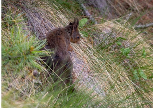
Red Crossbill & Red Squirrel

Back in Evolène late afternoon, there was a chance to relax or walk about the town or down to La Borgne river for a quick check of the butterflies.