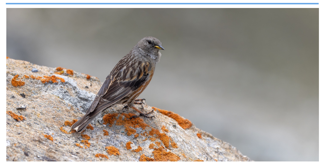
Alpine Accentor and Asian Fritillary