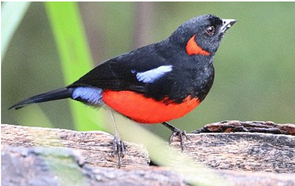
Scarlet-bellied Mountain Tanager