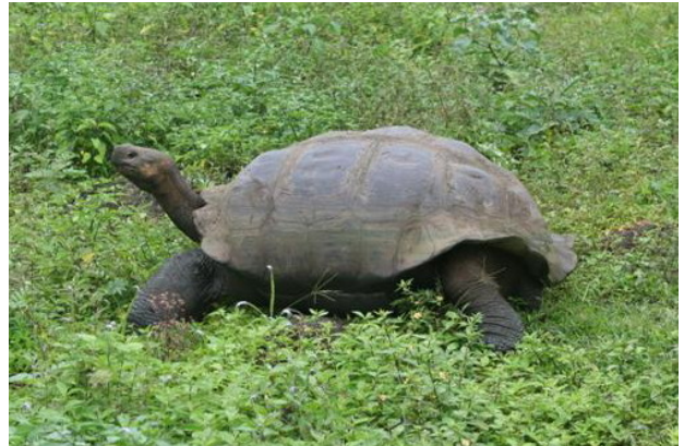
Giant Tortoise, Santa Cruz