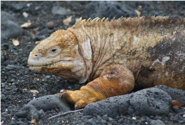
Land Iguana, Isabela