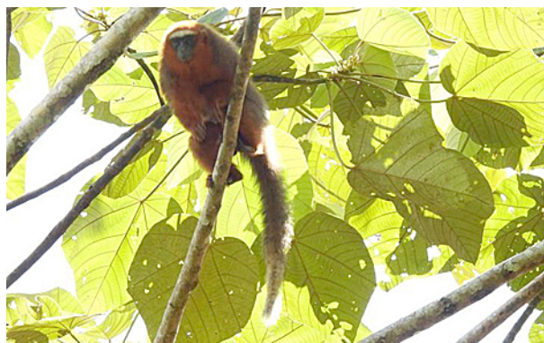
Red Titi Monkey

We returned to the lodge for lunch, and rested. In the afternoon, we found the last monkey species we needed, the White-bellied Spider Monkey. We had seen ten species of monkey at the Napo Wildlife Center, and twelve species in total on our tour. We returned to do the list and have dinner; later on, we did our last night activity, during which we saw a Lowland Paca.