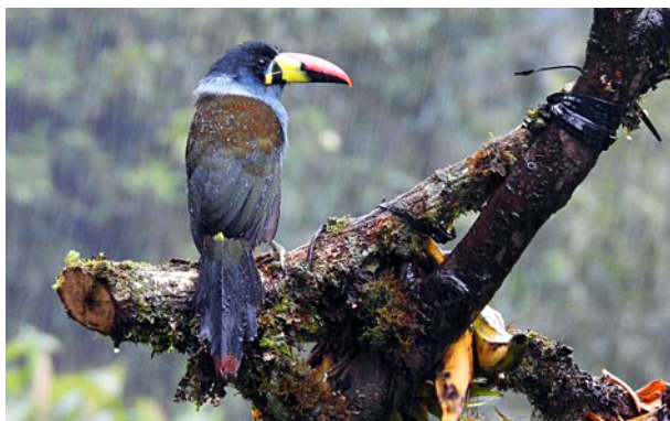
Grey-breasted Mountain Toucan