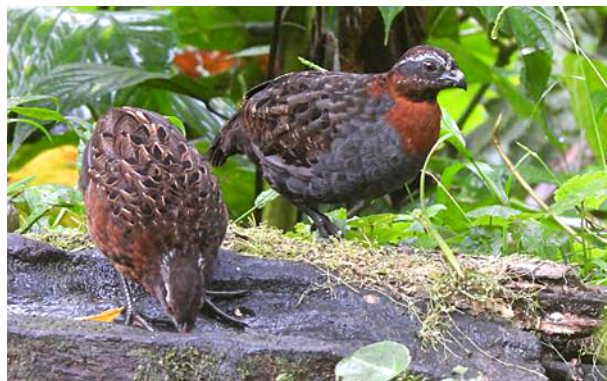
Rufous-breasted Wood Quail