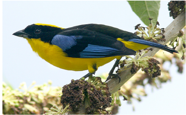
Blue-winged mountain Tanager