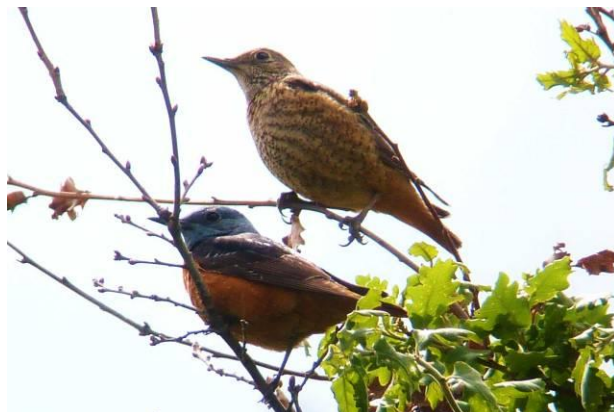
Rufous-tailed Rock Thrush