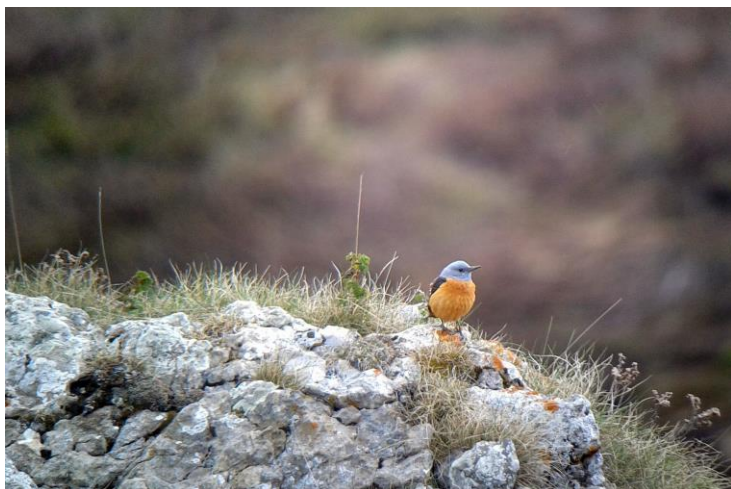
Rufous-tailed Rock Thrush (Tom Mabbett)

With a slight improvement in the weather we took our chance to spend a day in the upper reaches of the Pyrenees with a visit to the Aisa Valley. We travelled through some stunning scenery before reaching the end of the road and setting off on foot. The steep and steady early ascent levelled off as we climbed alongside the tumbling river, with our arrival at the easier flatter section with an amazing panorama of high peaks all around the lush grassy valley floor. The flowers here were spectacular with abundant gentians, orchids