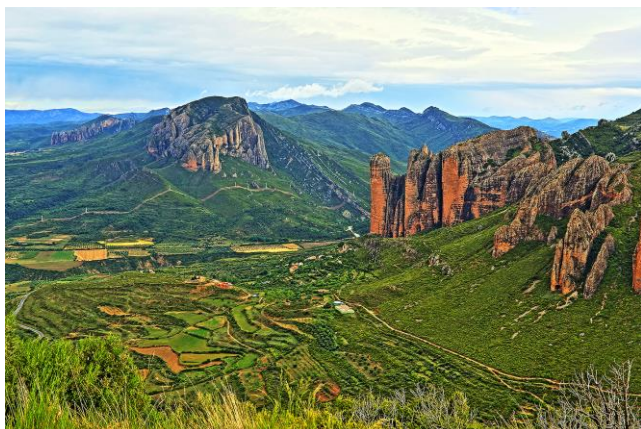
Pinnacles of Riglos (Bret Charman)

The surrounding scrub held a Spotted Flycatcher and a Melodious Warbler while a Rock Sparrow sang from the roof of a nearby barn. The distant crags that were festooned with the flowering panicles of Saxifraga longifolia also held several Griffon and Egyptian Vultures. We drove on passing the impressive Pinnacles of Riglos to visit the lesser-known and slightly less impressive Pinnacles of Aguero. Here we walked along the base of these towering