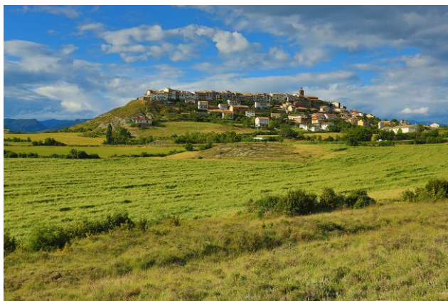
Berdun (Bret Charman)

Today was spent with firstly, a walk from the hotel to the River Veral, and after lunch, and a short drive, the River Aragon. Soon after setting off from the village we entered the eroded 'badlands' below. Early birds encountered here included Blackcap, Garden and Melodious Warblers in the scrub while overhead several Honey Buzzards passed on migration. At our feet several attractive species of flower caught our eye such as Linum narbonense , Ononis fruticosa and Thymus vulgaris . On arriving at the river we took a route alongside through the scrubby alluvial shingle beds.