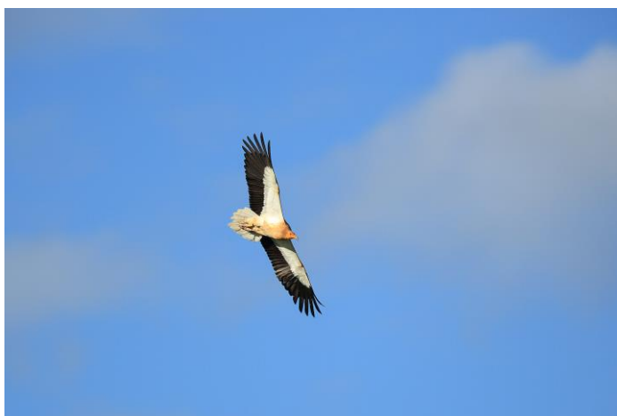
Egyptian Vulture (Bret Charman)

The keen birders in the group undertook the first of regular early morning pre-breakfast walks from the hotel becoming familiar with the local birds. We began the morning with a short walk along a section of path leading to the Hermitage of the Virgin of la Pena. A singing western Bonelli's Warbler was soon heard and glimpsed in the Downy oak woodland along the trail alongside which grew the lovely Brimeura amethystina . With rain starting we retreated to the vehicles pausing under the shelter of the trees to avoid the heaviest downpour.