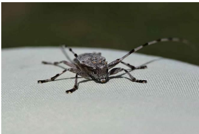
Timberman Long Horned Beetle