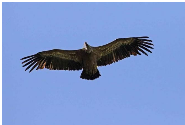
Griffon Vulture