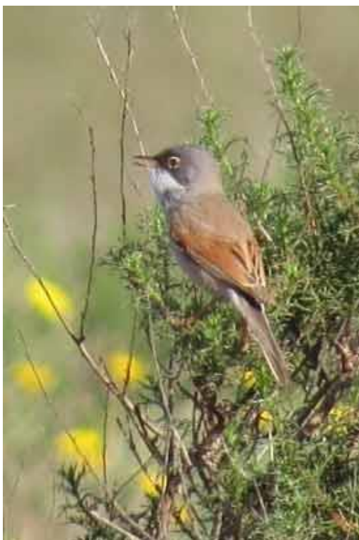
Spectacled Warbler