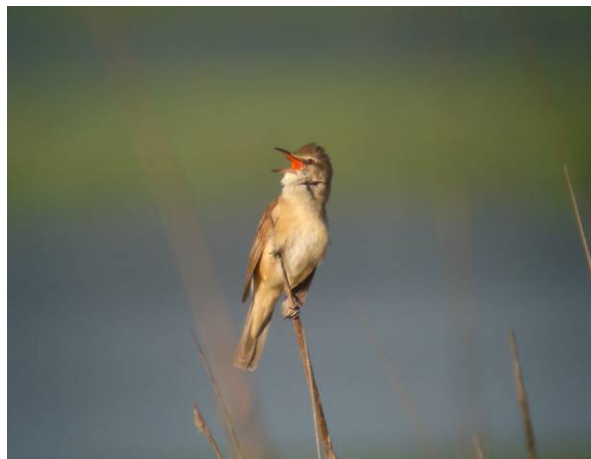
Great Reed Warbler