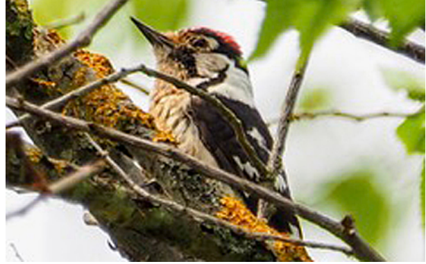
Lesser Spotted Woodpecker