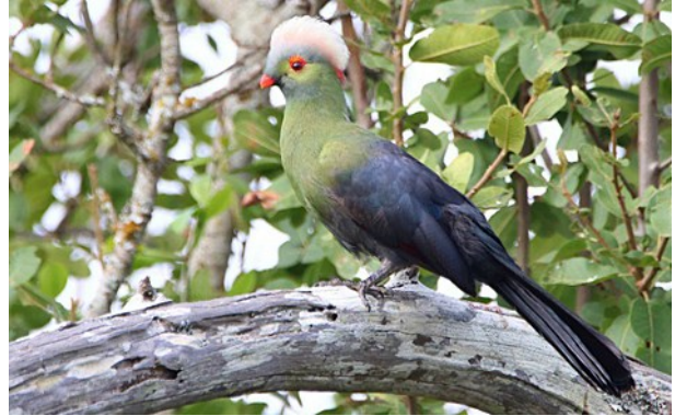
Prince Ruspoli's Turaco