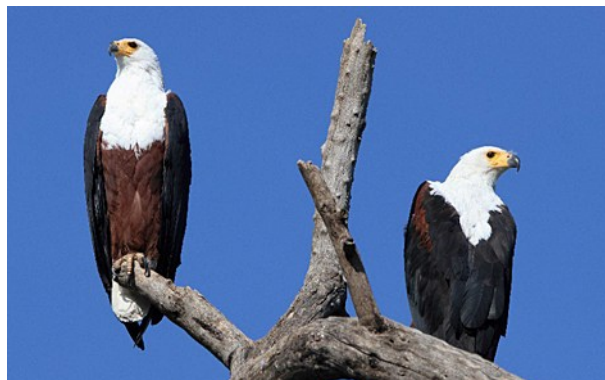
African Fish Eagles

This was another day with a substantial amount of travel, along a fascinating and scenic route, passing out of the Rift Valley, first into the wheat-growing areas near Dodala, where we made a stop for the endemic 'Erlanger's Lark' (now treated as a subspecies of Blanford's Lark) and the near-endemic Rusty-breasted Wheatear, then over the high pass (3500m) east of Washa, and finally down into the grassland basin around Dinsho. Several stops in this area produced Cape Eagle-Owl, and two endemics (Abyssinian Longclaw and Blue-winged Goose), together with two near-endemics (Rouget's Rail and Abyssinian Owl). The grasslands also led to close encounters with Common Warthog, Mountain Nyala and Bohor Reedbuck. The night was spent at a small hotel in Robe.