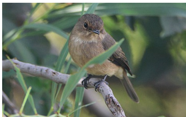
African Dusky Flycatcher