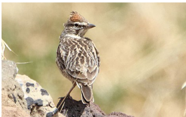
Blanford's (Erlanger's) Lark