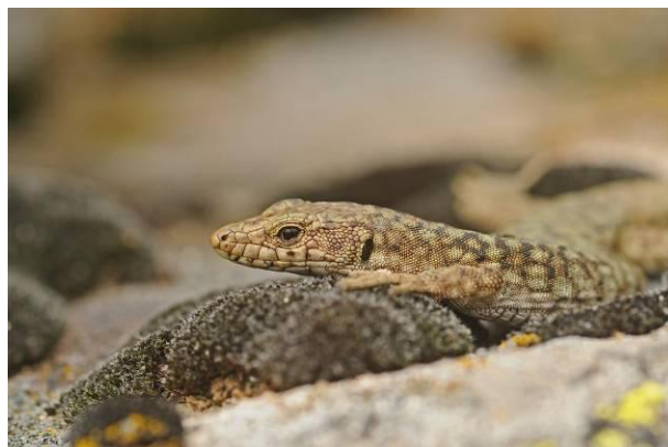
Bedriaga's Rock Lizard