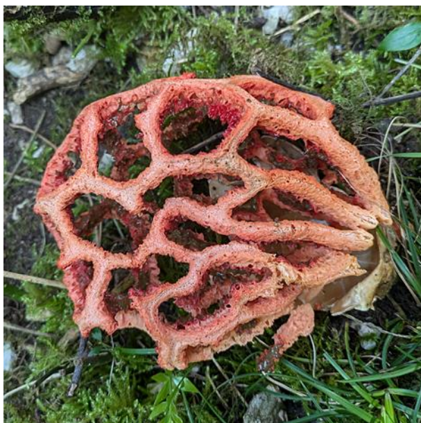
Red Cage Fungus