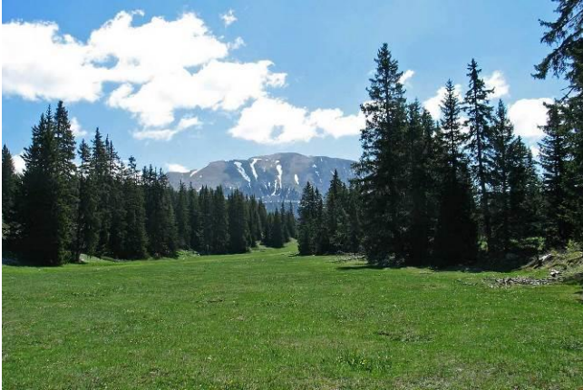
The Grand Veymont from the Haut Plateaux