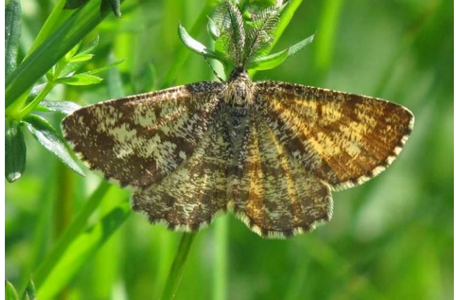
Common Heath - Ematurga atomaria