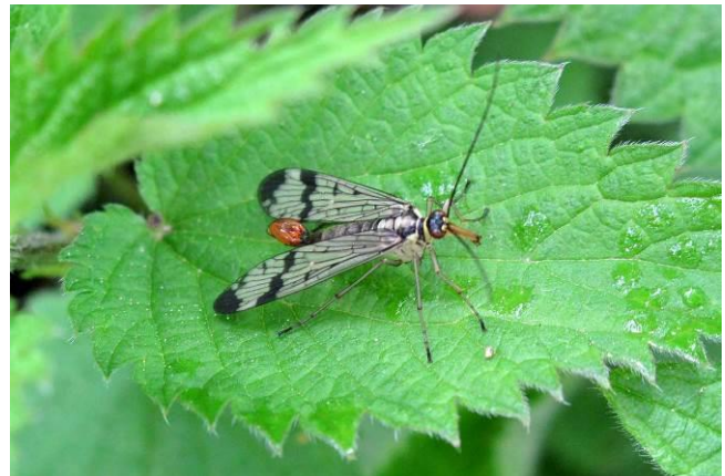
Scorpion Fly - Panorpa meridionalis