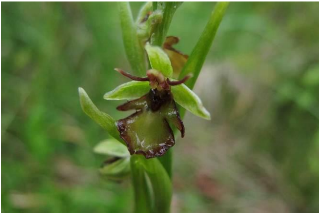
Ophrys sphegodes x Ophrys insectifera