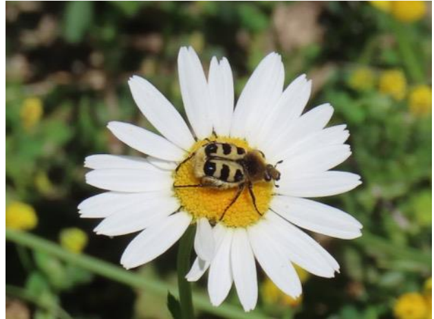
Bee Beetle by Peter Ogden