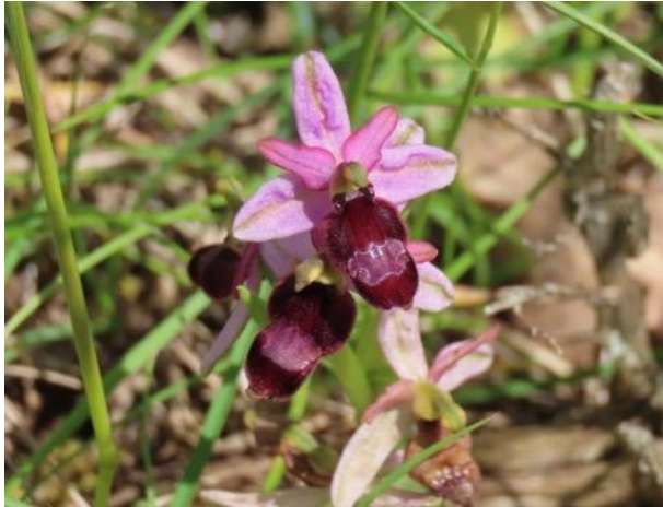
Drome Orchid – Ophrys x flavicans by Peter Ogden