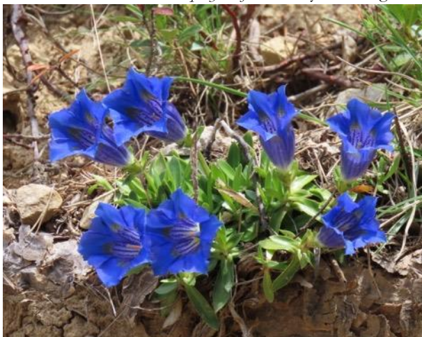
Gentiana angustifolia