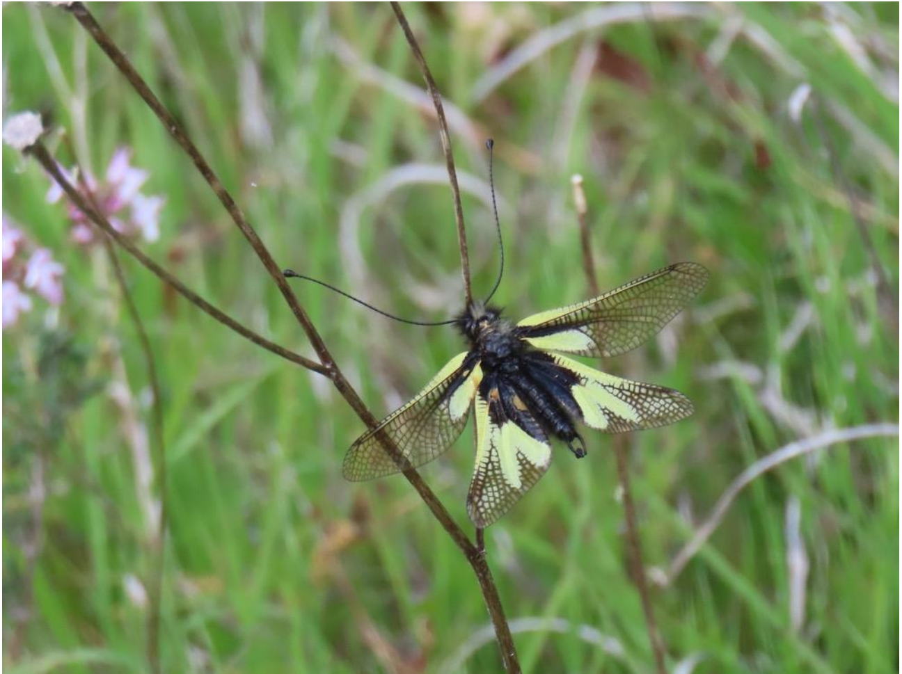
Owlfly