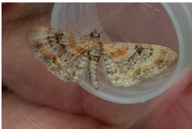
Toadflax Pug