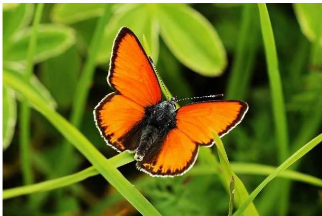
Purple-edged Copper