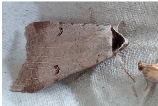
Scarce Black-neck by Paul Harnes