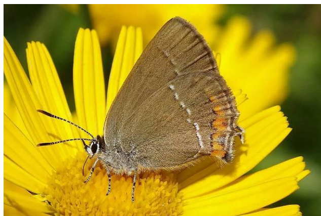
Sloe Hairstreak