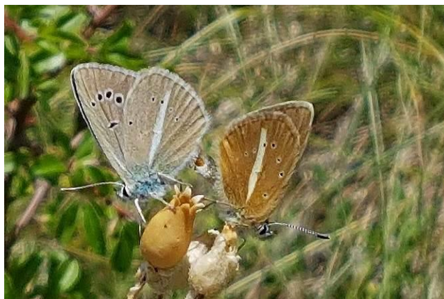
Damon Blues mating