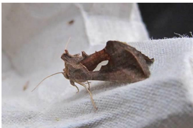
Dewick's Plusia