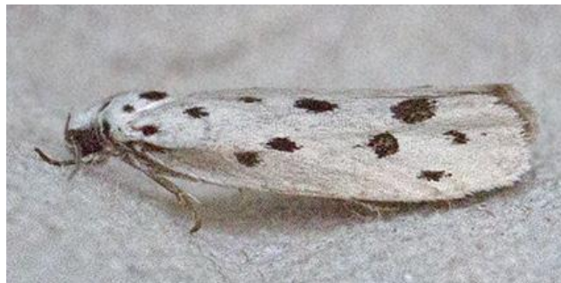
Ethmia dodecea by Hugh Griffiths