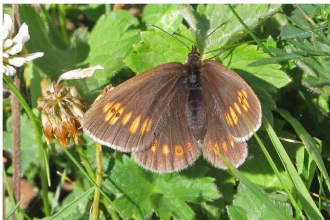
Almond-eyed Ringlet