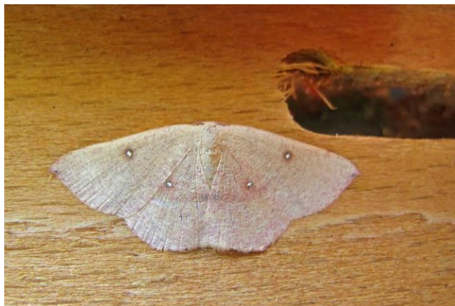
Birch Mocha