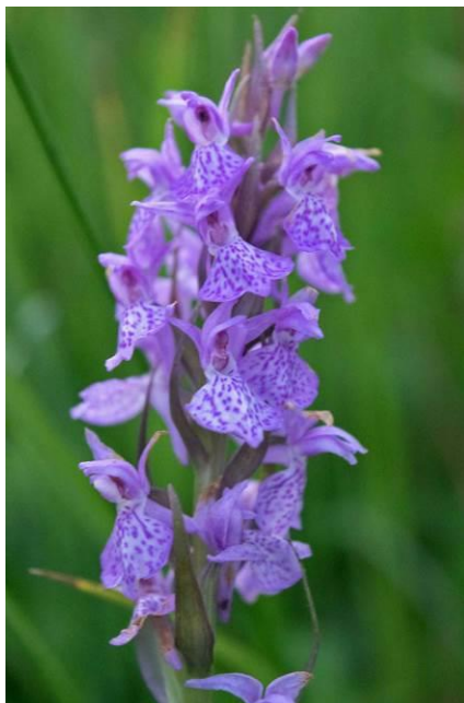
Southern Marsh Orchid