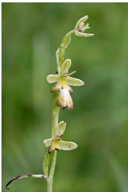
White Fly Orchid