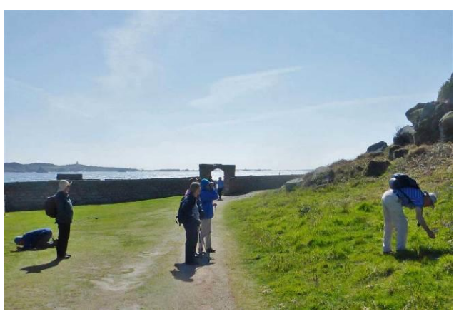
Clients on the Garrison