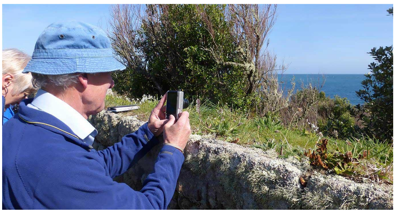
Client Photographing Small-flowered Catchfly (Silene gallica)