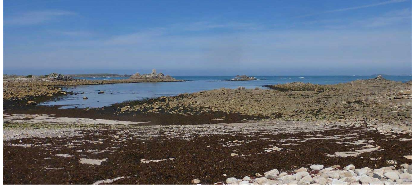
View from Periglis, St. Agnes