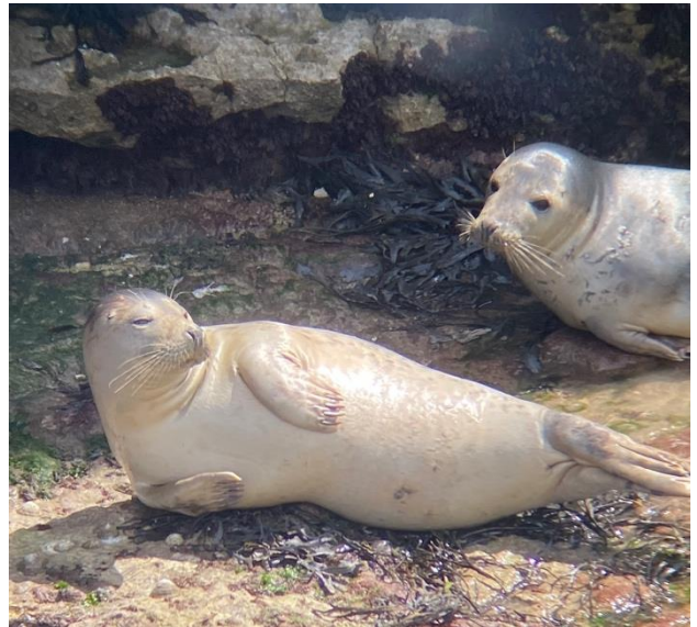
Common Seals, Flamborough