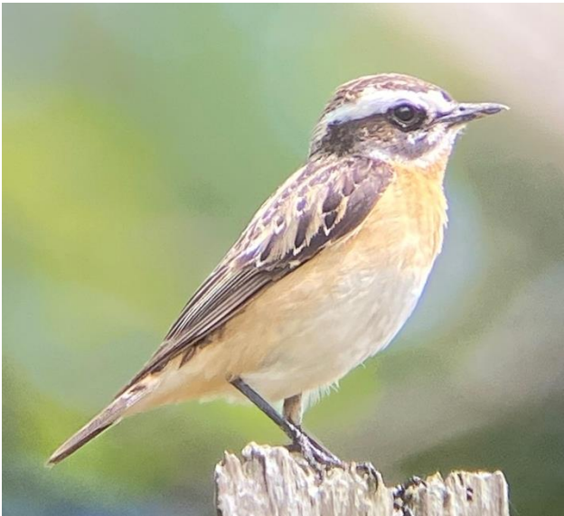
Whinchat, Wheeldale Moor