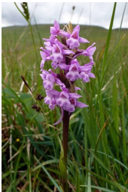
Fragrant Orchid, Gymnadenia conopsea