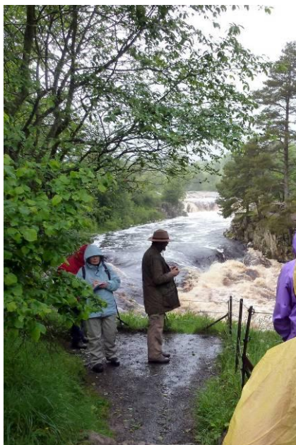
Clients at Low Force